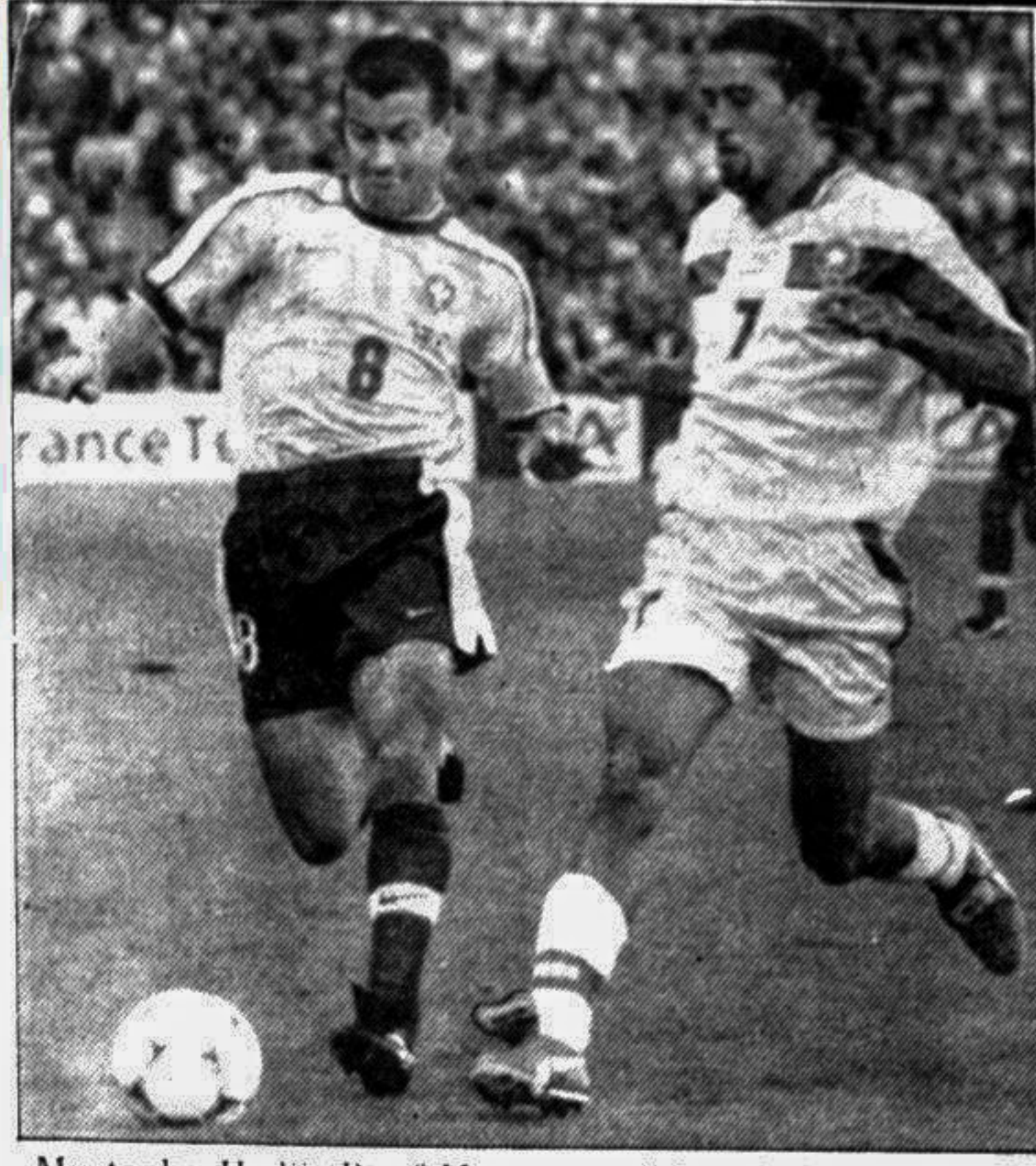
Mustapha Hadji (R) of Morocco and Brazil skipper Dunga battle for possession at Nantes on June 16.

"They're very strong but they tend to be predictable," said striker Jesus Arellano. "I think we can beat them with superior ball-handling. I think a dose of Mexican cunning can make the difference."