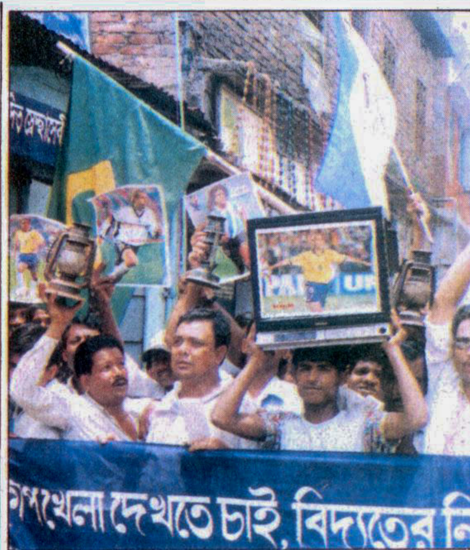
Soccer fans in Lalbagh area staged a demonstration yesterday demanding smooth power supply during the World Cup matches.

The committee conducted a series of meetings since its formation on October 17, 1996 to formulate a prudent, forward-looking, private sector dominant and export-oriented industrial policy.