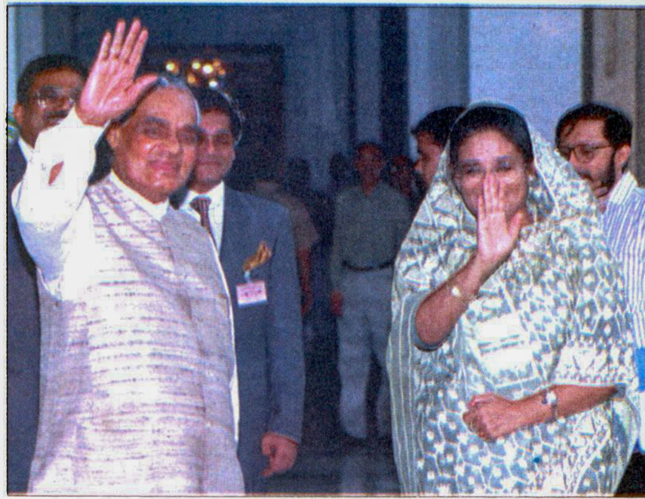
Prime Minister Sheikh Hasina and her Indian counterpart Atal Behari Vajpayee (L) wave to photojournalists prior to their talks in New Delhi yesterday.

After the meeting, a spokesman for the Bangladesh government told newsmen that Vajpayee said India and Pakistan cannot be hostage of the past. All problems should be solved but this needs patience. The Indian Prime Minister said, "We are prepared to discuss all issues with Pakistan including Kashmir, but third party's intervention is counter-productive." Prime Minister Sheikh Hasina appreciated the Indian position on unilateral moratorium on nuclear tests. She also welcomed the move by India and Pakistan to resolve their problems bilaterally. Referring to the bilateral relations between Dhaka and New Delhi, Vajpayee said, "We have See Page 12 Col 4