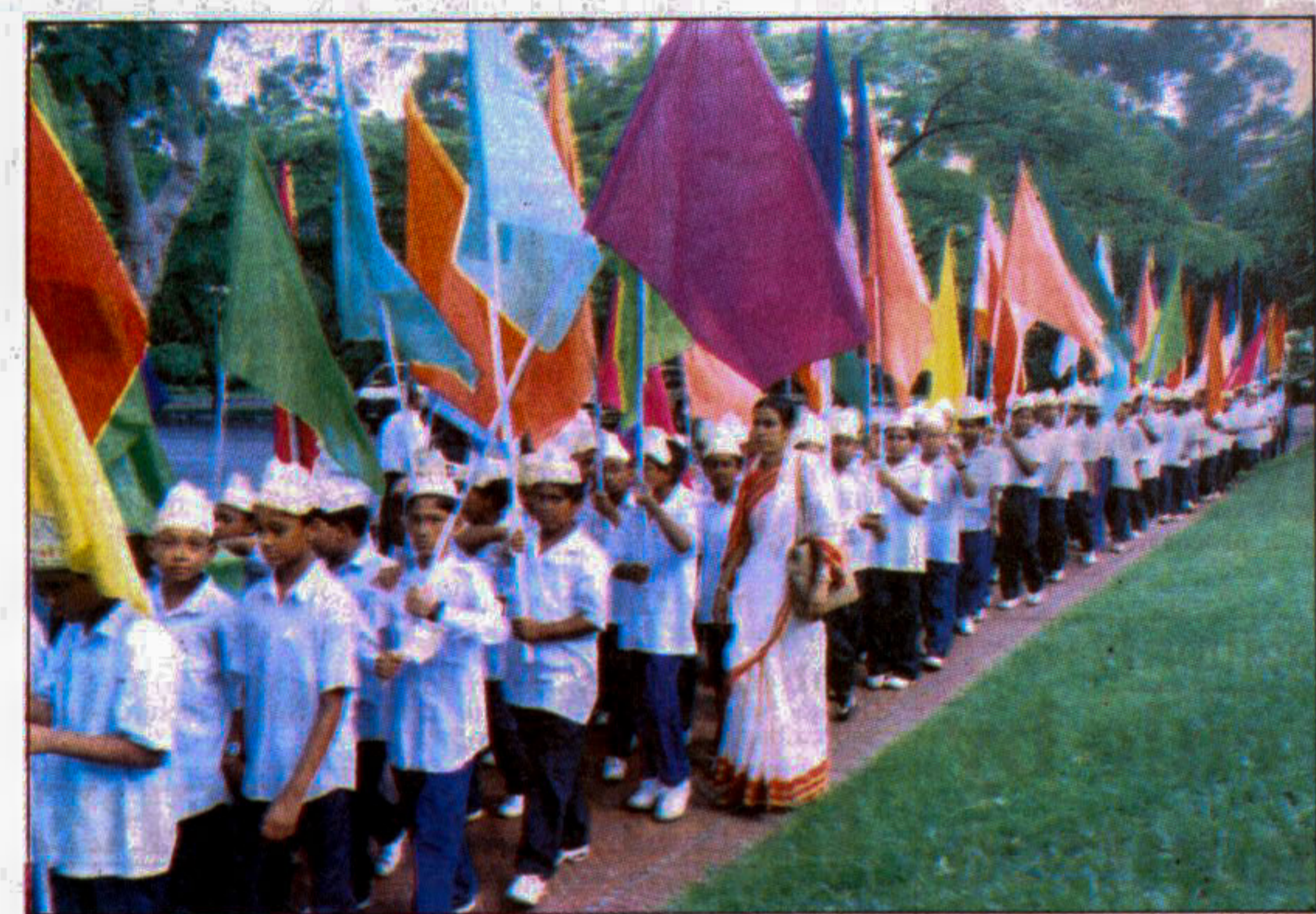
A colourful children's procession was brought out in the city yesterday on the occasion of National Primary Education Week '98.

Discussions about making the forthcoming SAARC conference in Colombo effective will also figure at the official talks in Delhi, sources said.