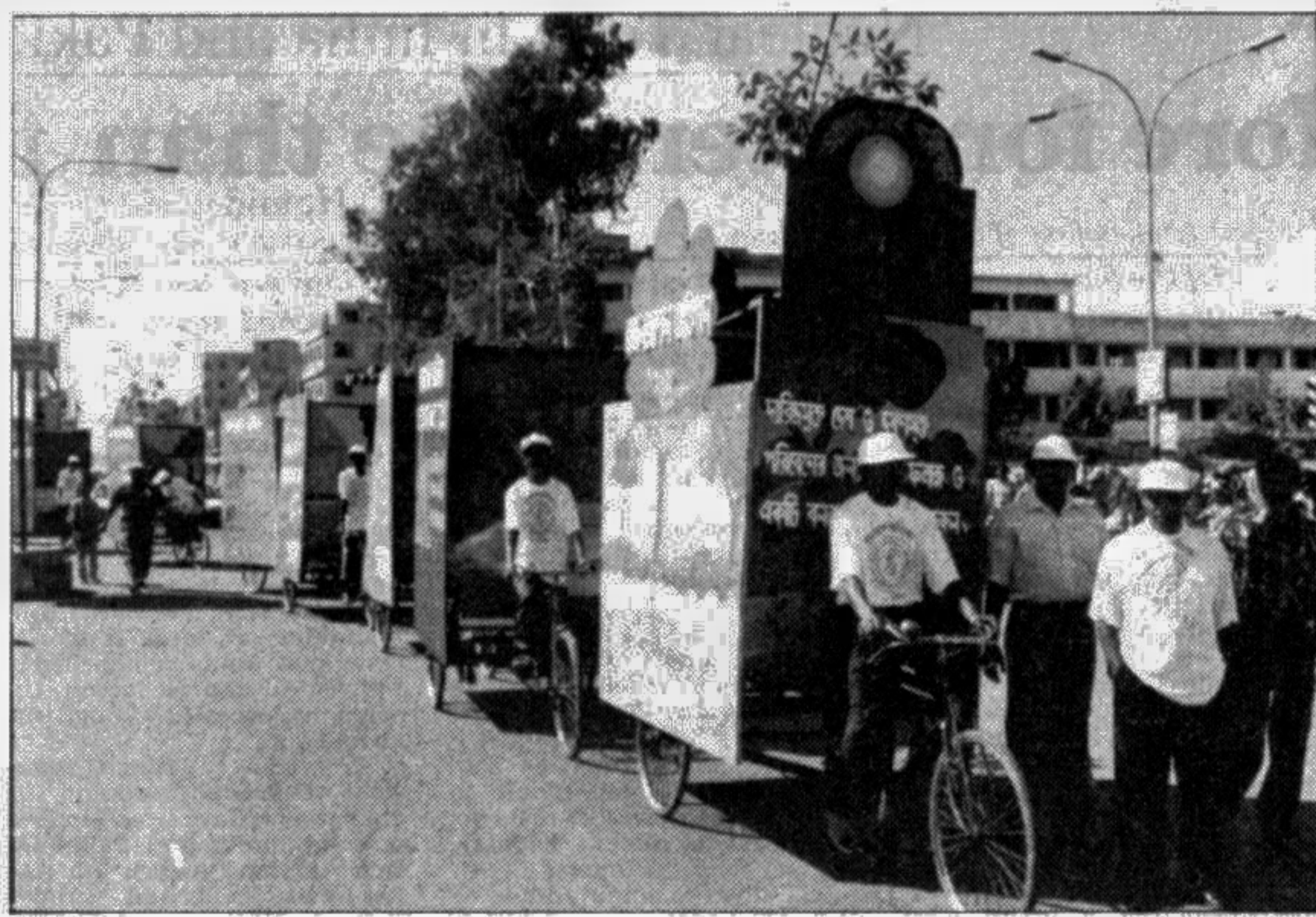
A Ministry of Forest and Environment rally marking tree-plantation drive in the city yesterday.