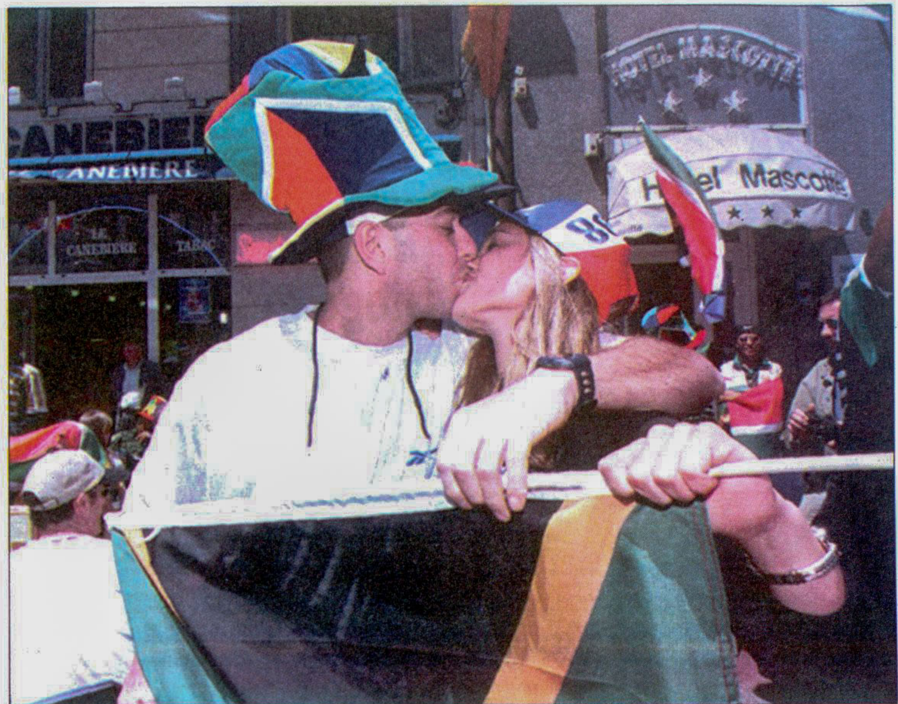
INTER CONTINENTAL SMOOCH! A South African man and his French partner show-off their affection at Marseille on June 12.

The court action enraged many South Africans and led to a vigorous campaign against Luyt and his association.