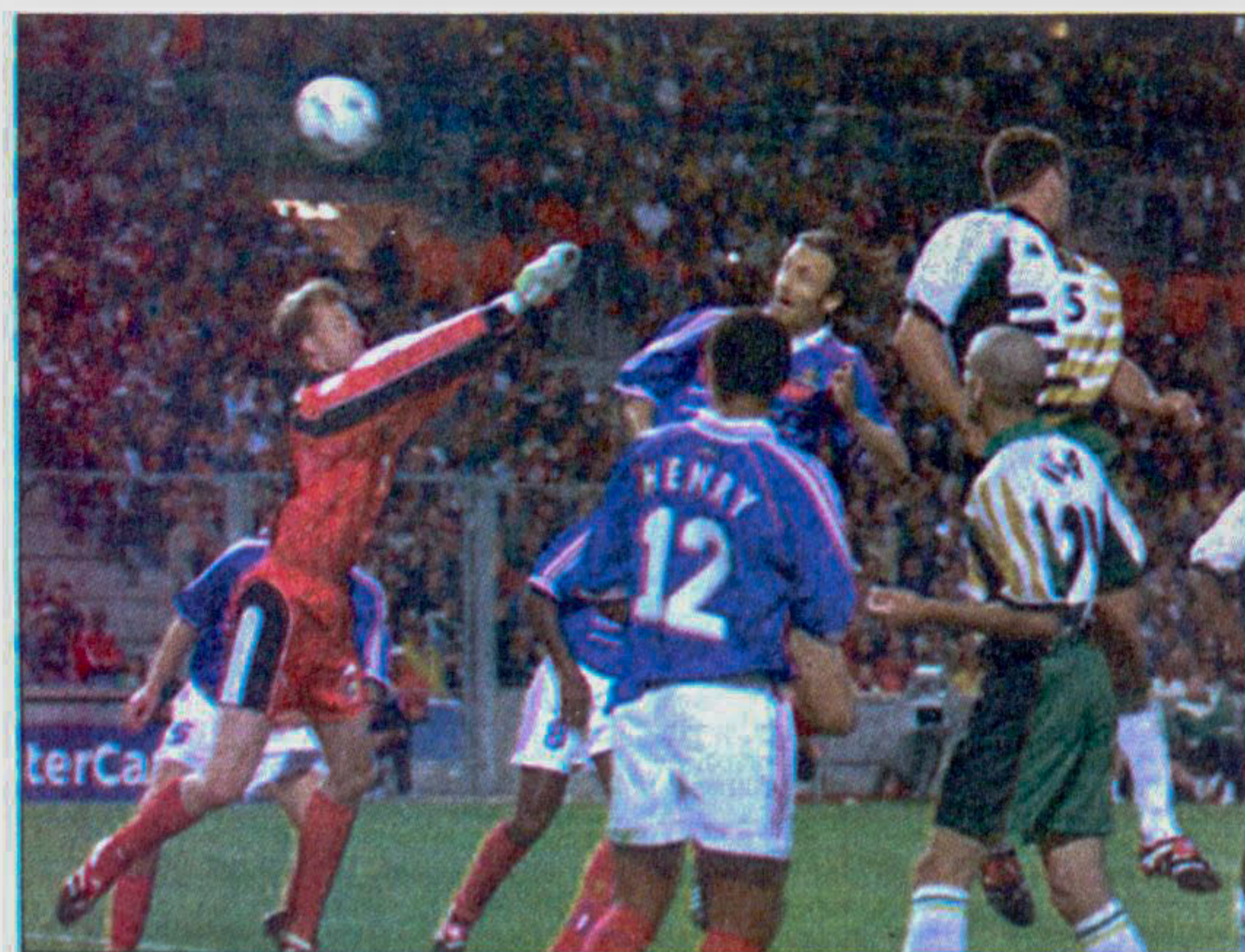
Christophe Dugarry (C) of France scoring the opening goal with a header against South Africa in Marseille on June 12.