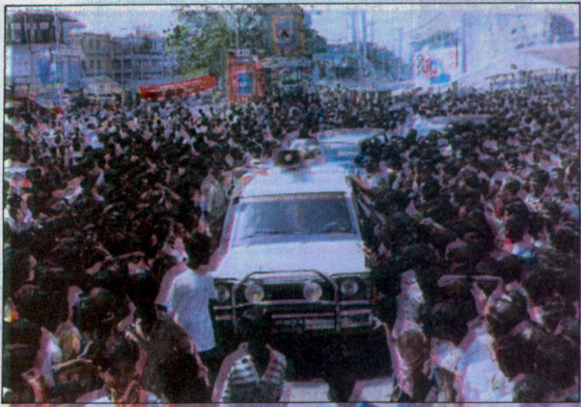
The BNP-led long march that halted for several hours in Chittagong started for Khagrachhari from Chittagong Circuit House at about 10 am yesterday.

It contained the words: "Never behave violently, always keep your self-control, give everything you've got, then accept defeat gracefully and celebrate your victories like true sportsmen."