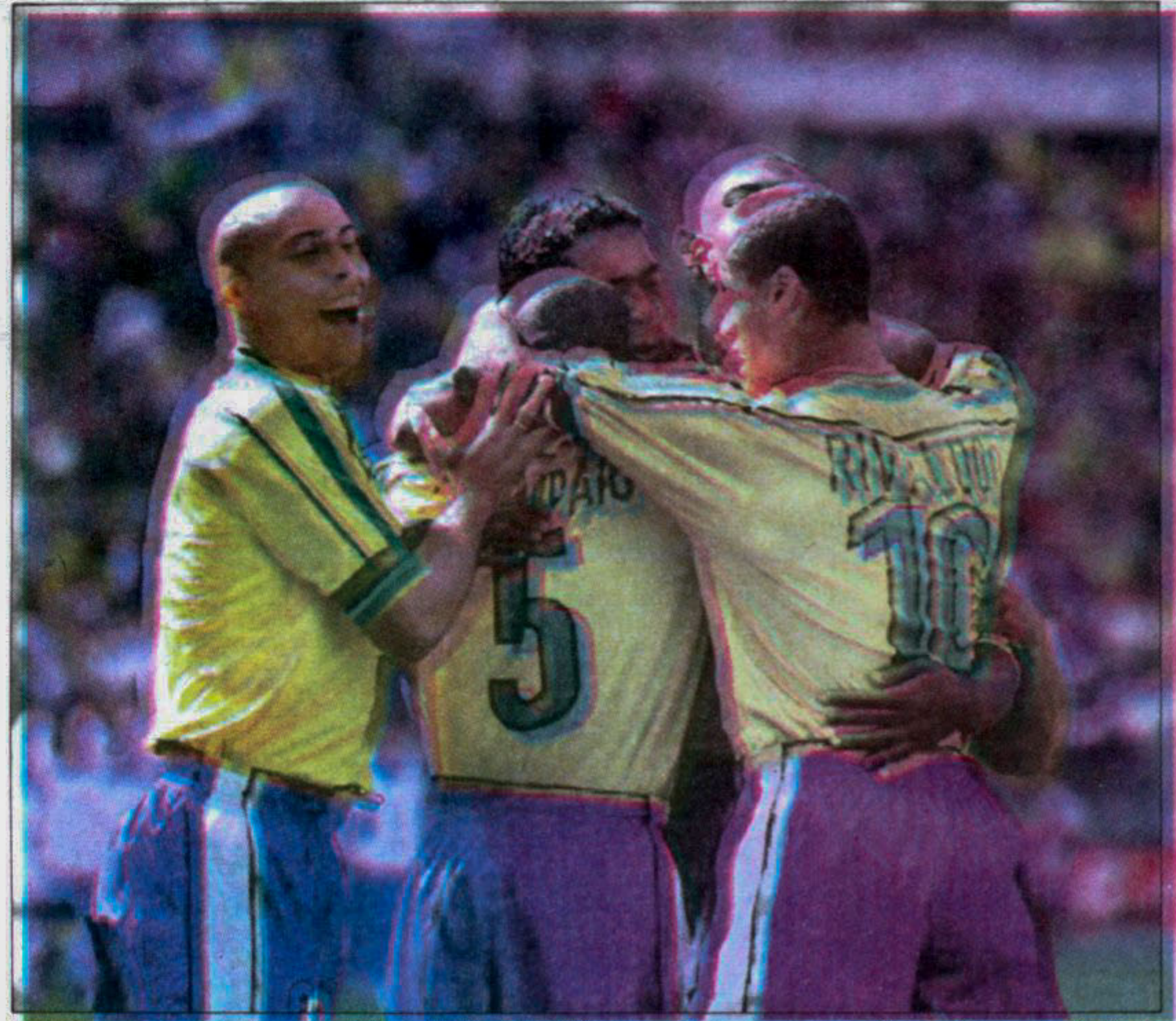
Brazilian forward Ronaldo (L) and Rivaldo (R) cheer their teammate Cesar Sampaio (C) who opened the score against Scotland yesterday.