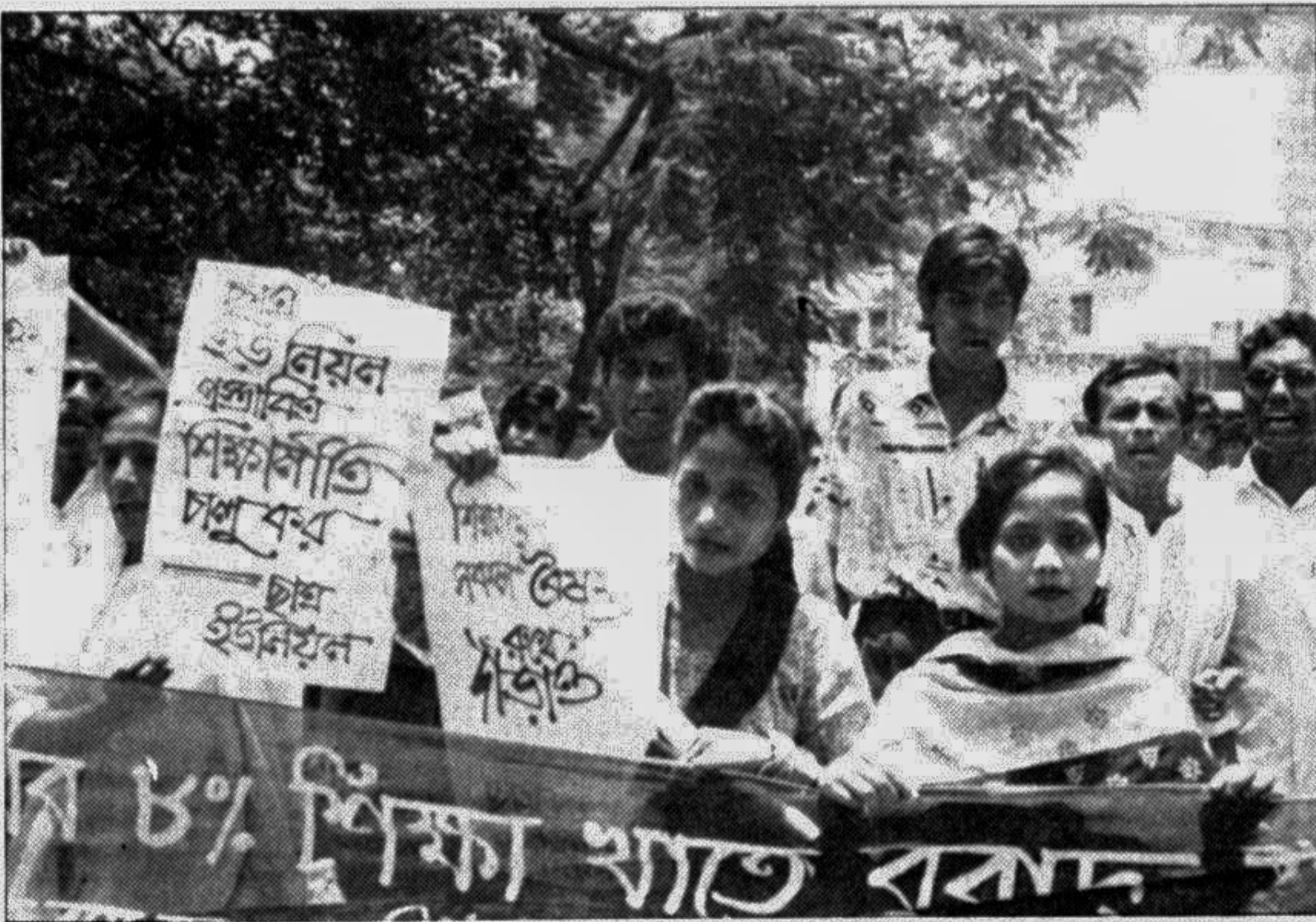
Chhatra Union brought out a procession on the campus yesterday demanding increase in allocation of funds for education.

Farmers were said to be the worst sufferers of the heat wave as a good number of peasants fell in comma on their paddy fields while working under the scorching sun.