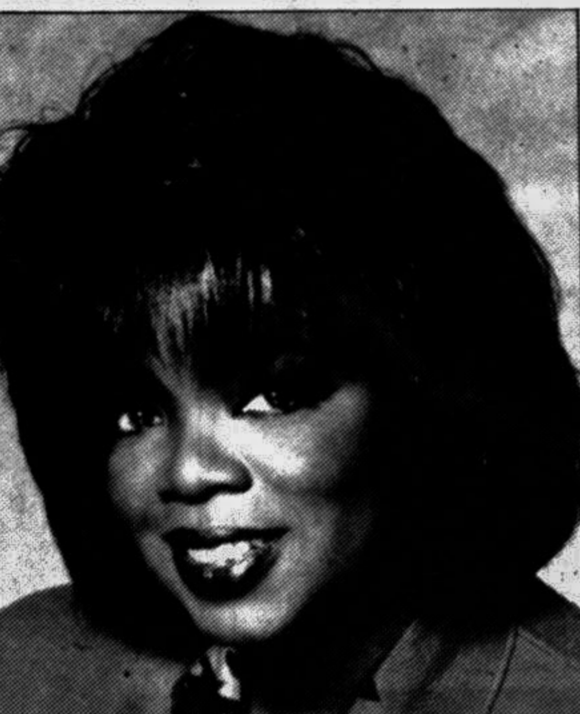
The Oprah Show at 11:00 am on Star Plus

CHANNEL V 6:00am Turn on TV 6:30 Over the Edge 7:00 Turn on TV 7:30 Rewind VJ Sophiya 8:30 Turn On T, VJ 9:30 House Arrest 10:00 Turn on TV 1:30 By Demand VJ Trey 2:30 Liberty First Day First Show 3:00 Oye 4:00 Turn on TV 4:30 Volume Double 5:30 Turn on TV 6:30 By Demand VJ Trey 7:30 Liberty-First Day First Show 8:00 House Arrest 8:30 Close Up Close Encounters 9:00 Videoman Flashback 9:30 Turn on TV 10:00 Liberty First Day First Show 10:30 Bacardi Blast 11:00 Turn on TV 11:30 Freestyle 12:00am Speak Easy 12:30 Turn on TV 2:30 Turn on TV Block A/ Thurs PM Int 3:00 The Ticket 3:30 Turn on TV 4:00 Asian Top 20