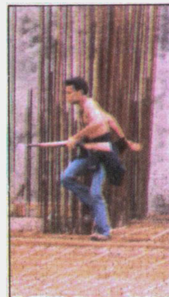
A youth is seen with a gun at Raghunathpur.