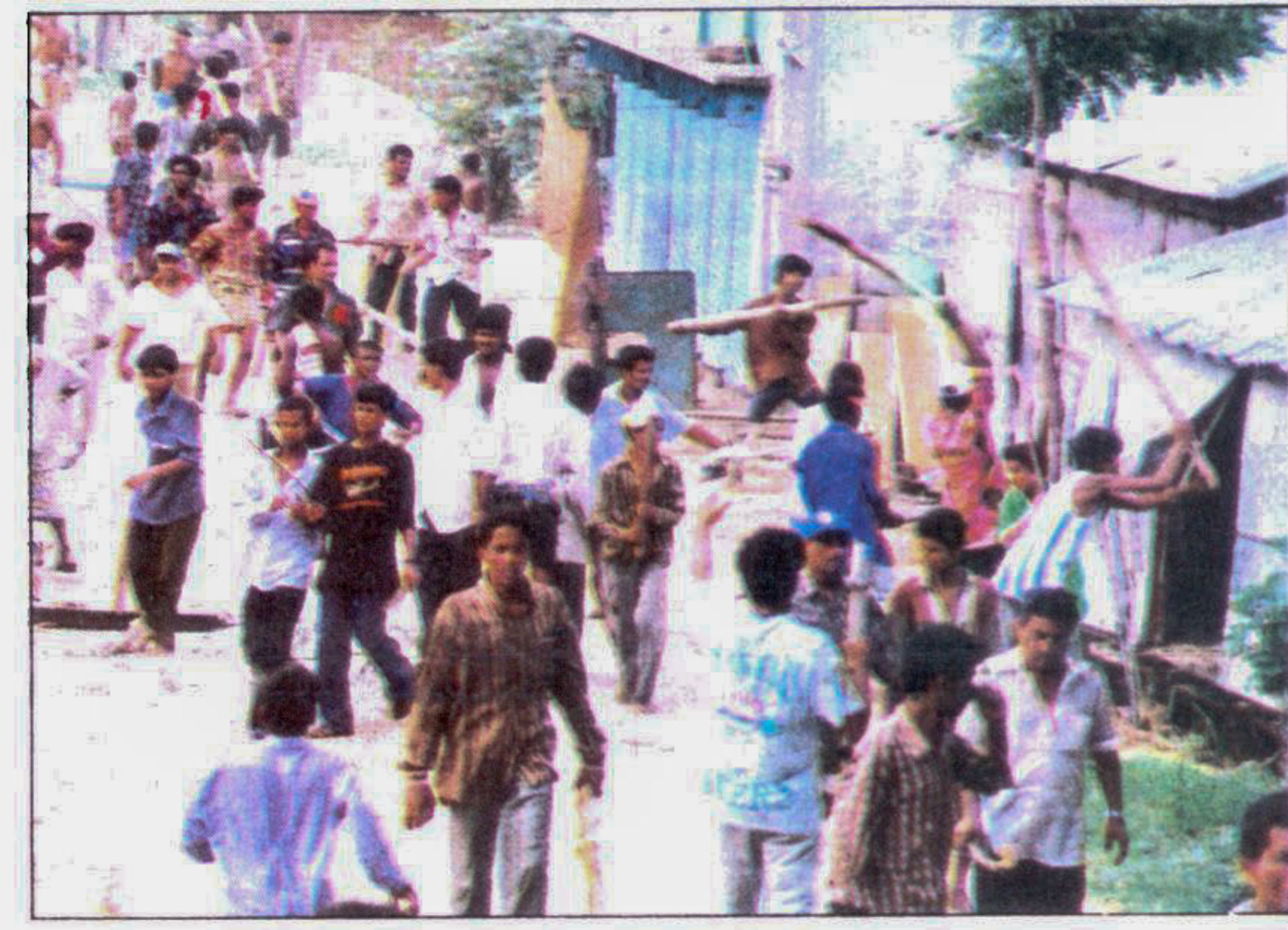
A group of youths went on rampage at Raghunathpur near Kanchpur bridge during the long march yesterday.