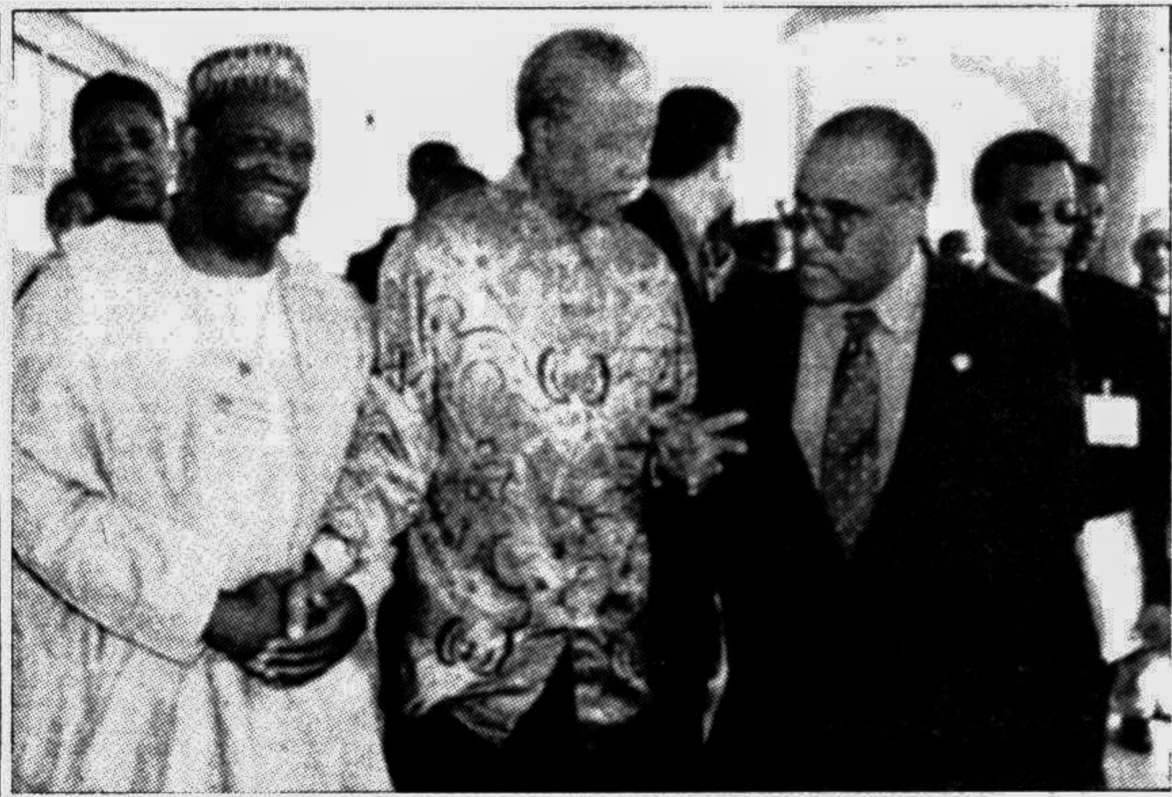
An unidentified Nigerian delegate holds the hand of South Africa President Nelson Mandela's hand while Mandela speaks to the Organisation of African Unity Secretary General Salim Salim after the preliminary meetings at the 34th annual OAU summit in Ouagadougou, Burkina Faso Monday.

The fight against drugs. "Pointing fingers is distracting," Clinton said. "It does not dismantle a single cartel, help a single addict, prevent a single child from trying — and perhaps dying — from heroin."