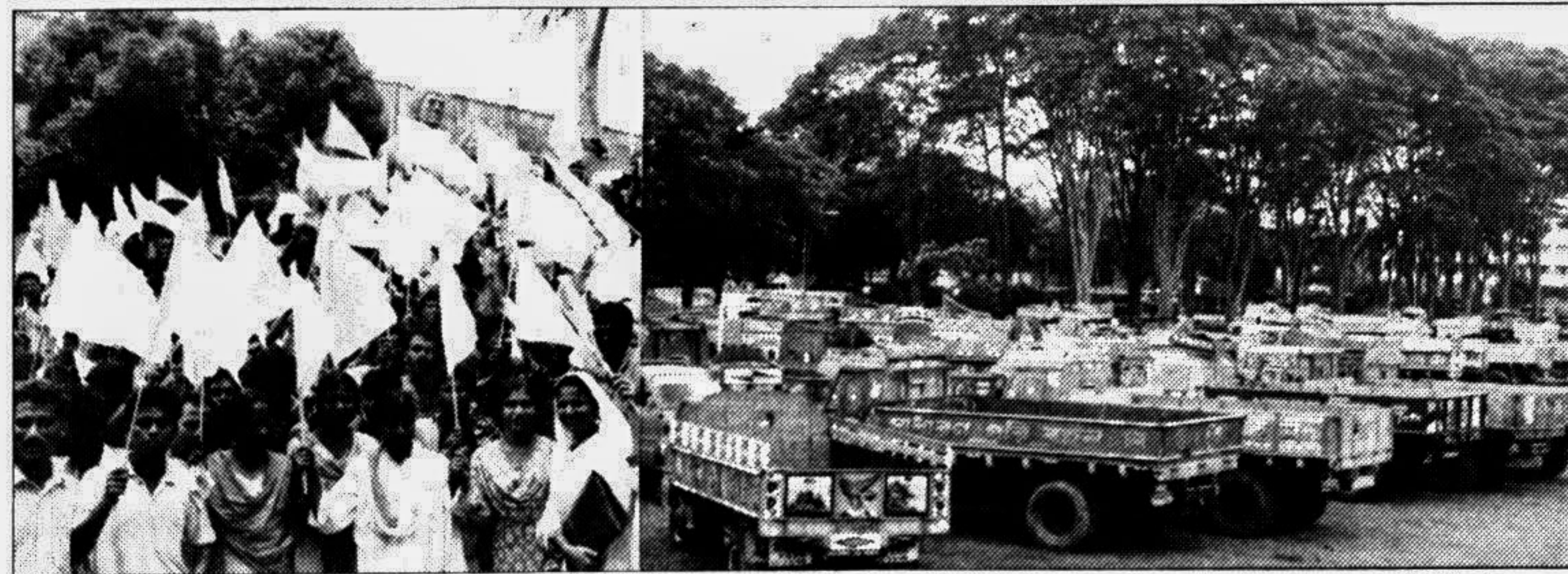
(Left) Chhatra League brought out a procession on the Dhaka University campus yesterday protesting BNP's long march. (Right) Trucks requisitioned by police on the eve of BNP's long march are kept at the Rajarbagh Police Lines.

The meeting termed Prime Minister Sheikh Hasina's statement about the programme 'provocative and motivated'. The PM said at a public rally in the city on Sunday that if