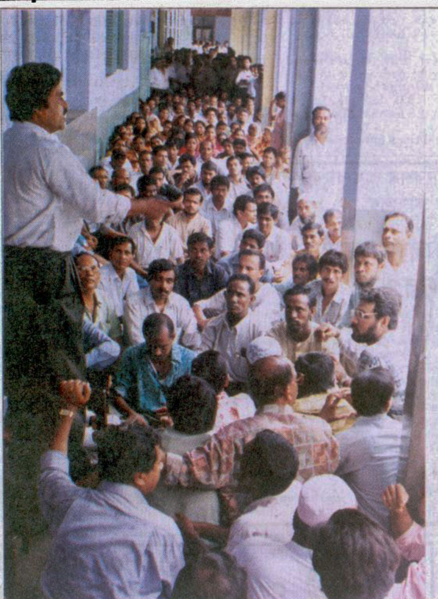
A section of government employees staged a sit-in inside the Secretariat yesterday.

The Shah Alam faction announced they would stage a sit-in before the Cabinet Secretary's office at 10 am today while the Zafar Ahmed group said they would stage a demonstration and rally near the 20-ster building at the same time.