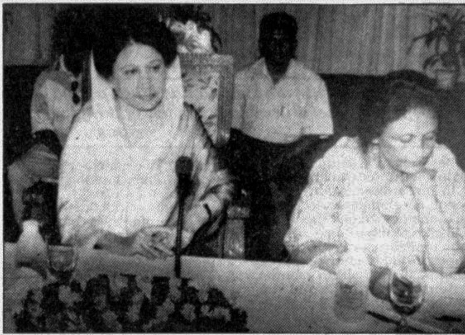
BNP chairperson Begum Khaleda Zia exchanging views with businessmen at Hotel Purbani in the city yesterday.

Dialogue: A dialogue on 'Gas and oil resources of Bangladesh: Hopes and concerns' will be held. Organiser: Bangladesh Jubo Union. Venue: Engineers Institution's seminar room. Time: 5 pm. Launching: The launching ceremony of 'National Road Safety Strategic Action Plan' will be held. Organiser: National Road Safety Council of Bangladesh. Venue: Sonargaon Hotel. Time: 9 am-11 am. Film session: Chala-Chitram Film Society has arranged a 3-day session of films of renowned Japanese actor Toshiro Mifune. Today's film: 'The Seven Samurai', directed by Akira Kurosawa. Venue: German Cultural Centre, Rd 9, Dhanmondi. Time: 4 pm. Discussion: An open discussion on 'CHT Act '98 and national solidarity' will be held. Organiser: Society for Parliamentary Democracy. Venue: CIRDP auditorium, 'Chameli House'. Time: 4:30 pm. Publication ceremony: The publication ceremony of a book, 'Andalusia' by Hasnat Abdul Hye, will be held. Venue: LGED auditorium, Agargaon. Time: 5:30 pm. Exhibition: An exhibition of bags made of jute, paper and cloth will be held. Organiser: ESDO. Venue: CDL, House: 39, Road: 14/A, Dhanmondi. Time: 10 am-5 pm. Film show: 'India: A Film Journey' by Louis Malle will be screened. Organiser: Zahir Raihan Film Society. Venue: Indian High Commission auditorium, Rd: 2, Dhanmondi. Time: 6 pm.