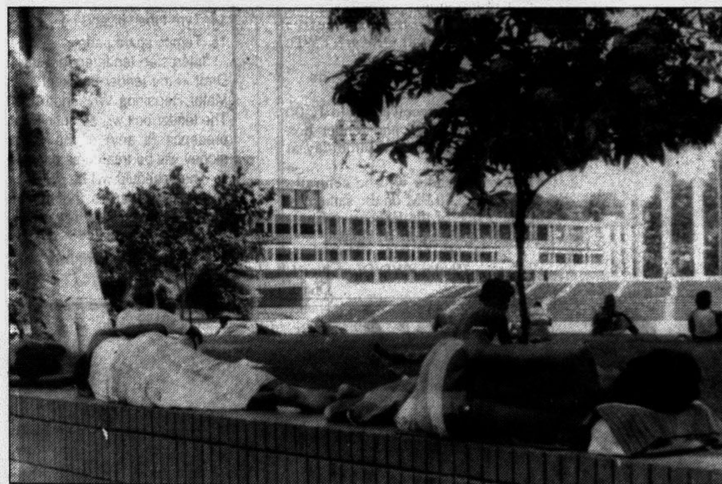
Some day labourers resting under the trees near Central Shaheed Minar during the scorching heat yesterday.