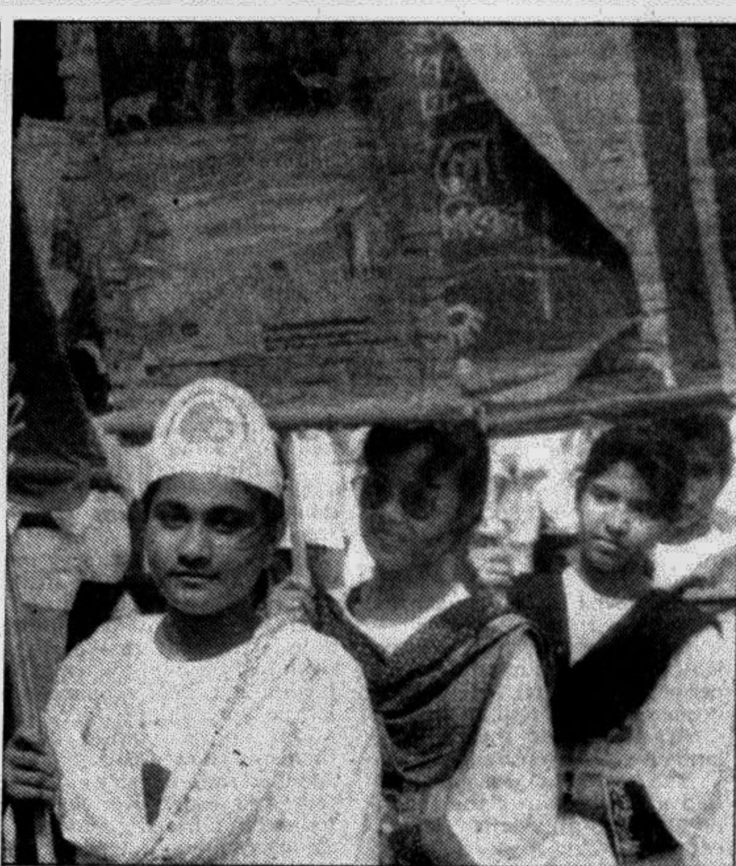
The Ministry of Environment organised a colourful procession in the city yesterday on the occasion of the World Environment Day.

Administration sources said that additional police force and BDR would be deployed here to maintain law and order.