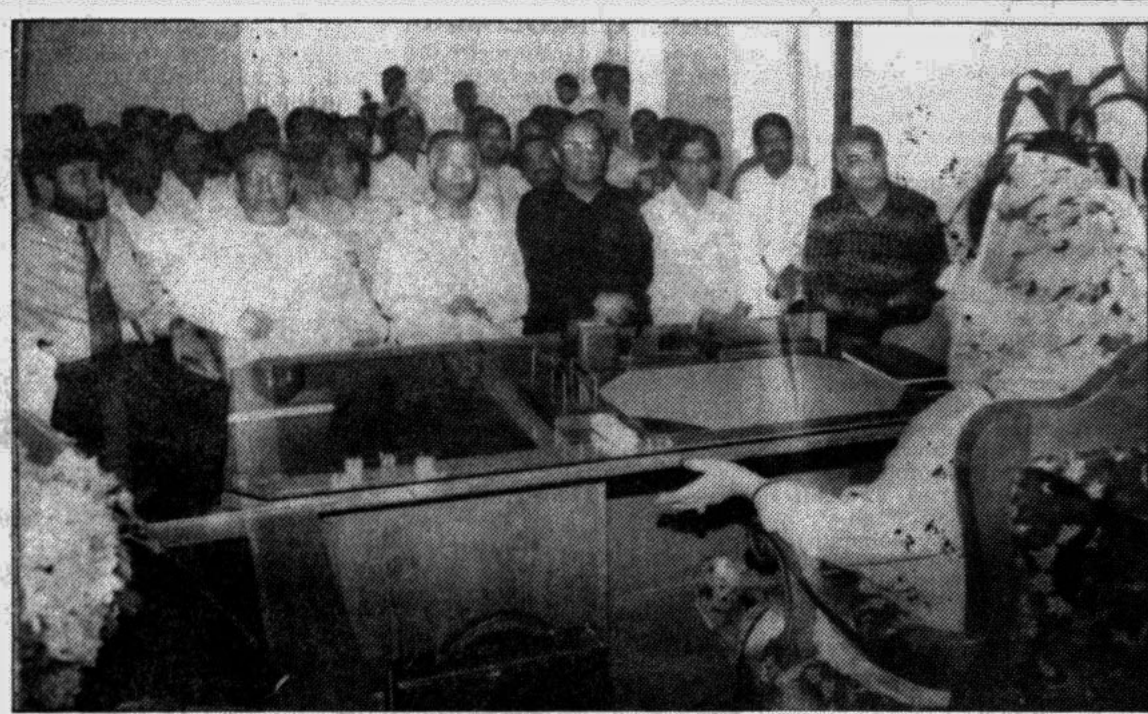
BNP Chairperson Begum Khaleda Zia exchanging views with lawyers at her official residence in the city yesterday.