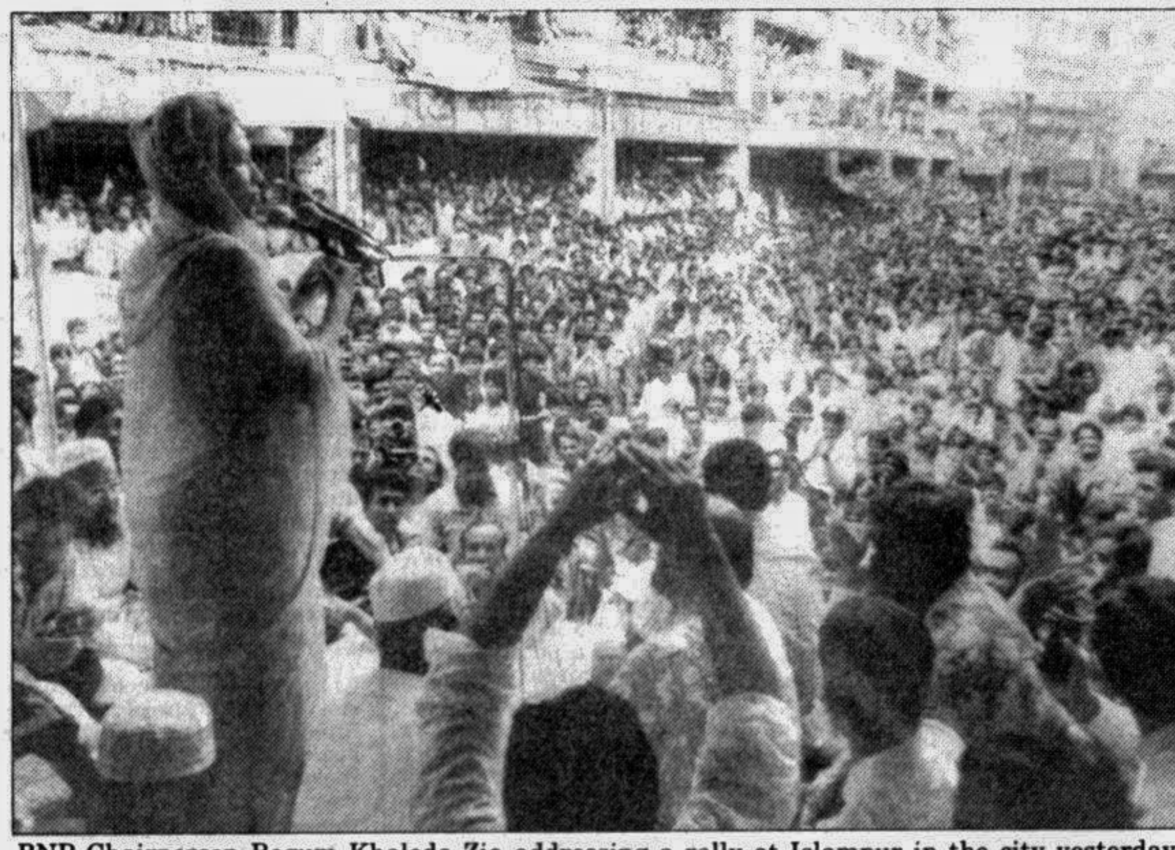
BNP Chairperson Begum Khaleda Zia addressing a rally at Islampur in the city yesterday in observance of the death anniversary of party founder and former president Ziaur Rahman.

FP advocacy programme opens next month By Staff Correspondent A four year advocacy programme on reproductive health, family planning and gender issues is beginning next month with a seven million US dollars UNFPA contribution. UNFPA representative Alain P Mouchiroud disclosed it in a meeting in the city yesterday. Representatives of different UN agencies and NGOs attended the meeting. The advocacy programme has been developed to address various issues and concerns. These include the high maternal mortality rate estimated at 470 per 100,000 live births, increase of discrimination against women, widespread preference for sons over daughters and discrimination in distribution of food and treatment between boys and girls. A summary paper of the programme mentioned that nine government ministries will be involved in implementing the advocacy programme until the year 2002. The programme envisages that reproductive health and gender issues would be integrated into the training curriculum of these ministries. In the advocacy programme, government, NGO and private sector resources have been mobilised to reach all target groups including the influential and the vulnerable and hard-to-reach groups.