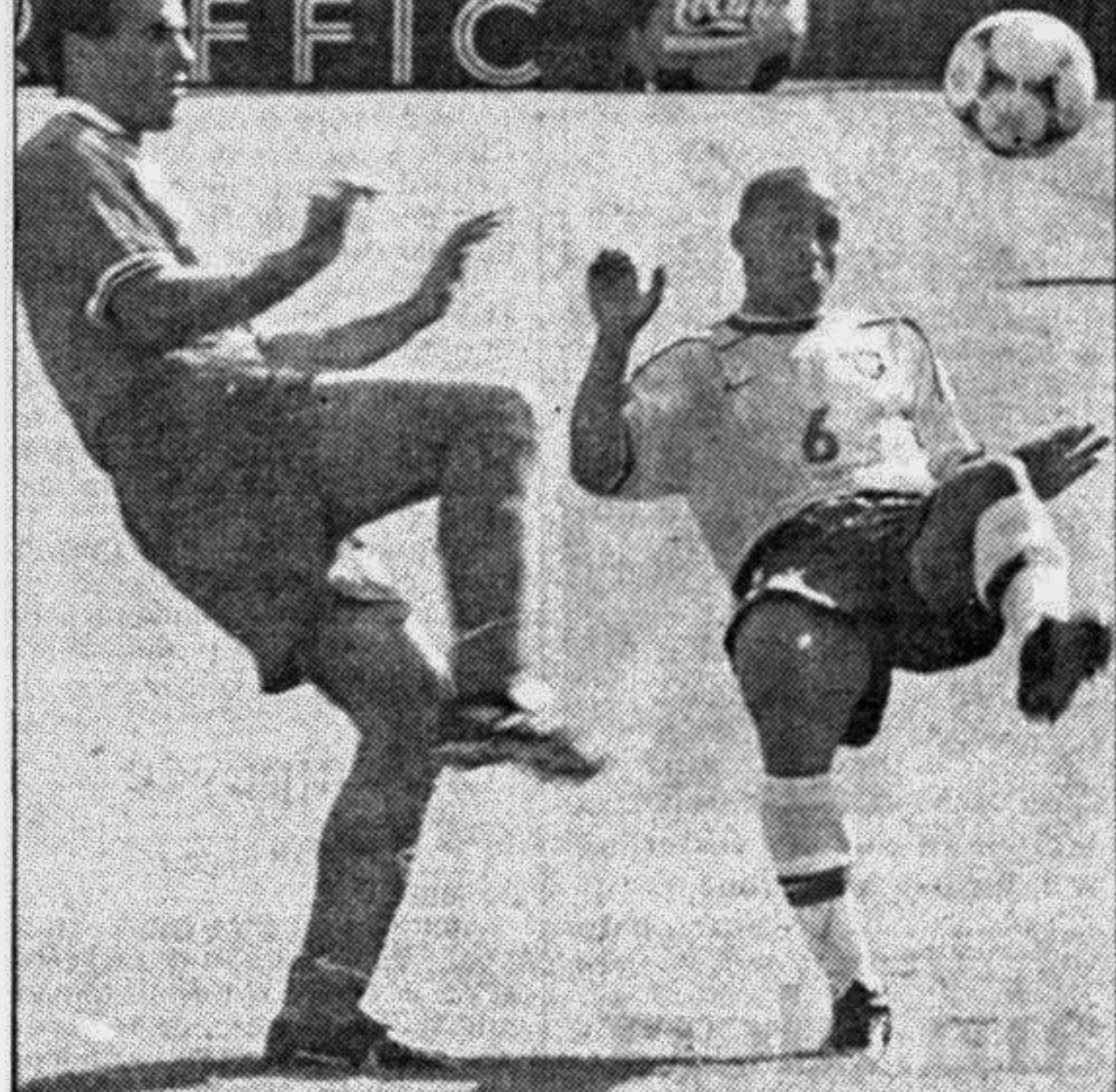
Brazil's Roberto Carlos (R) battles to gain control of the ball during a World Cup warm-up match against Andorra at Saint Ouen, Paris on June 3. Brazil won 3-0.

A 3-0 victory Wednesday over tiny Andorra, with barely enough professional players for three teams, was no test for the four-time world champions. For Zagallo, it wasn't even a