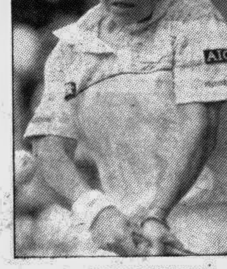
SANCHEZ-VICARIO better tournament this year having beaten last year's champion Iva Majoli 6-1, 5-7, 6-3 in the quarterfinal.

This was Davenport's sixth visit to Roland Garros and her previous best was a quarterfinal berth in 1996. But she had a