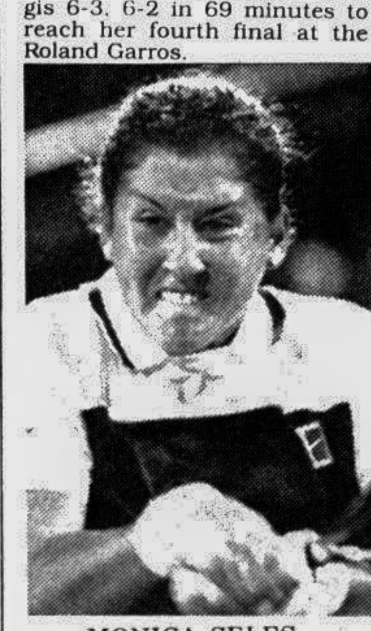
MONICA SELES The 22-year-old former Yugoslavian was on her favourite hunting grounds with three consecutive titles in 1990, '91 and '92.

PARIS, June 4: Monica Seles put aside her personal grief and went out in full fury burying Martina Hingis 6-3, 6-2 in 69 minutes to reach her fourth final at the Roland Garros.