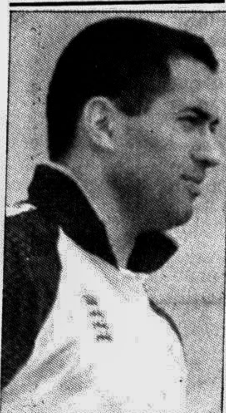
Adam Hollioake (England one-day cricket team captain) "I know that I am supposed to be under pressure, because every time I meet someone he tells me so."