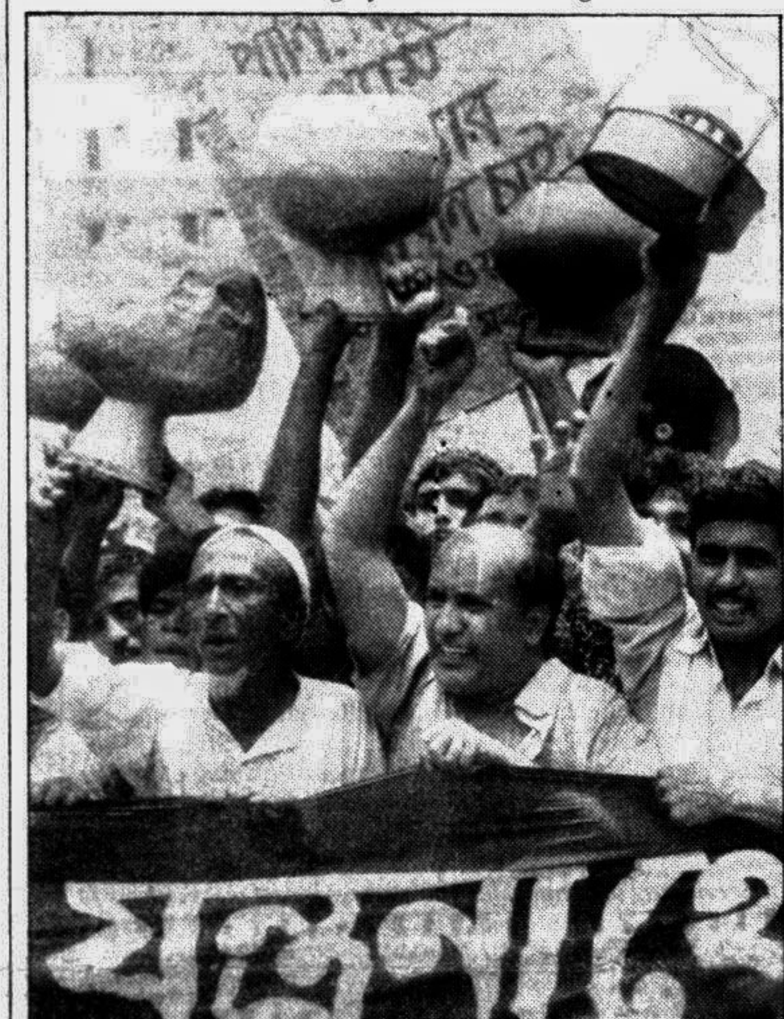
Residents of Kaettuly area brought out a procession in the city yesterday demanding smooth supply of water, gas and electricity.