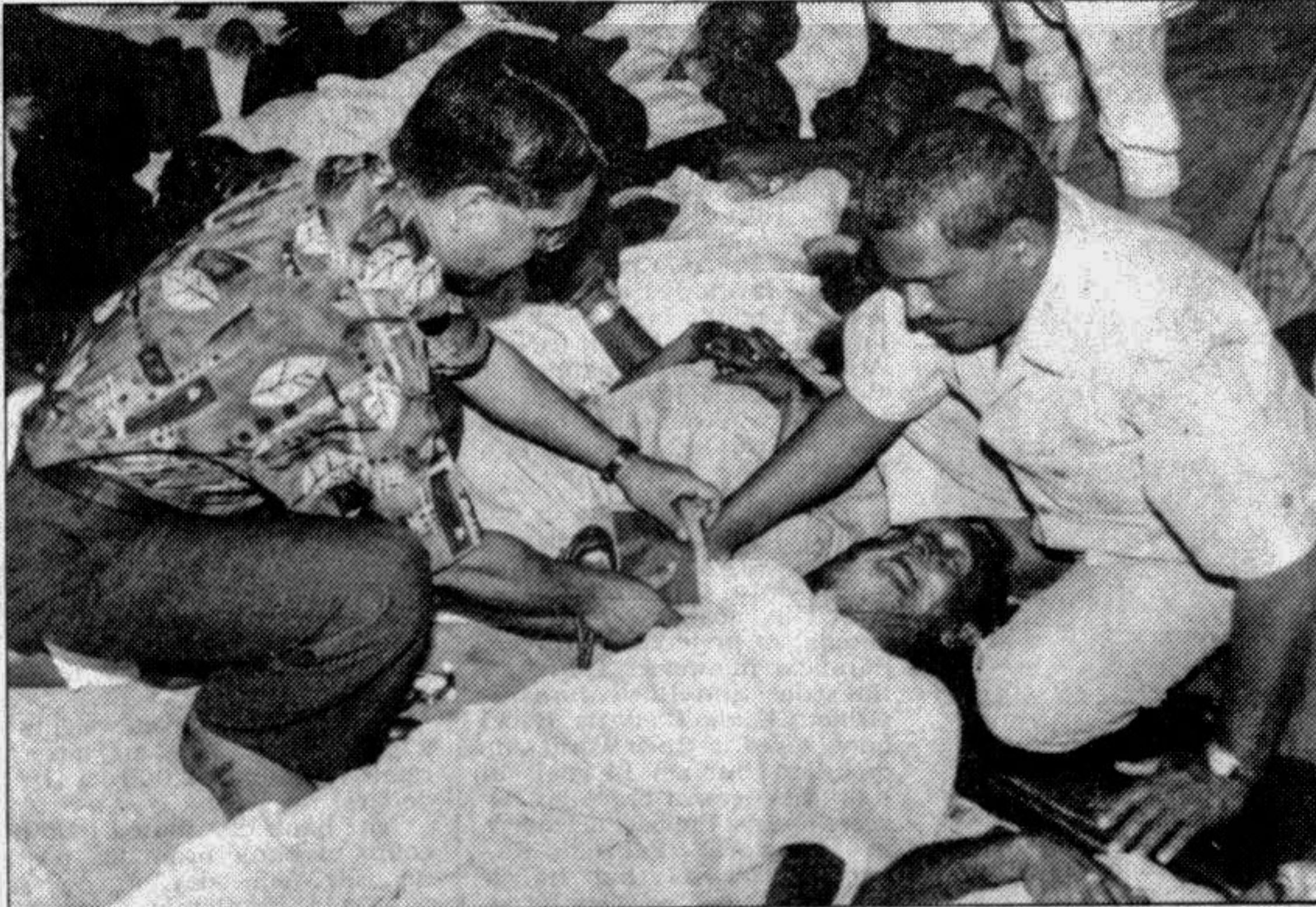
A non-government primary school teacher being treated by a doctor at Osmany Udayan yesterday where the teachers were staging a hunger strike. They withdrew their strike last night.

The World Bank recently congratulated the government for 'taking a pragmatic decision in approving the proposal'. In a letter to the shipping ministry, the World Bank said it may provide assistance for building necessary infrastructure and funds to the developer.