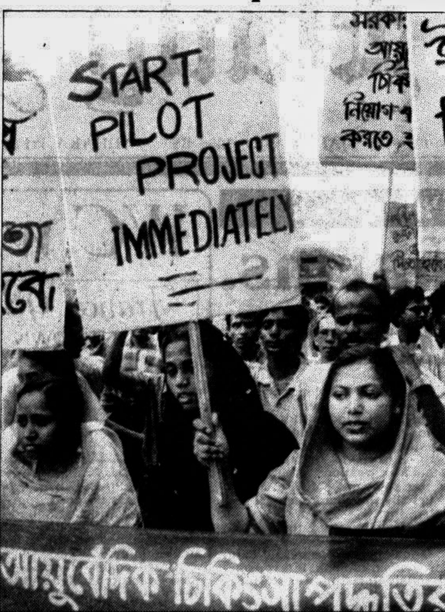
Government Unani and Ayuerbadic Medical College Students' Union and Internee Doctors' Association brought out a procession in the city yesterday calling for implementation of their six-point demand.