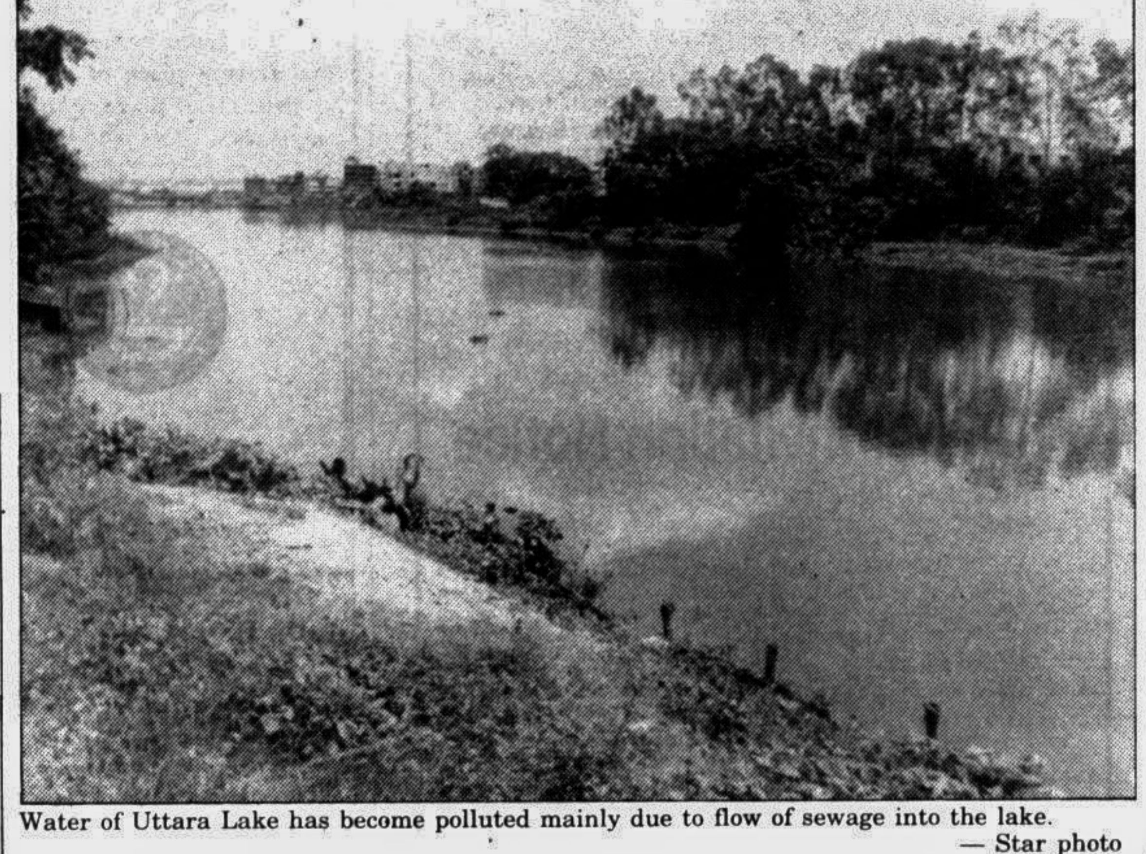
Water of Uttara Lake has become polluted mainly due to flow of sewage into the lake. — Star photo

By Morshed Ali Khan The water of Uttara Lake has become totally polluted emitting foul odors and posing serious health hazard in the vicinity. Spot investigation reveals that the pollution has occurred due to stagnation of the lake water, years of neglect and dumping of sewerage from the residential areas into the lake. The natural lake presently stretches over an area of two kilometres from Uttara Sector-5 towards the north. Earlier the See Page 12 Col 1