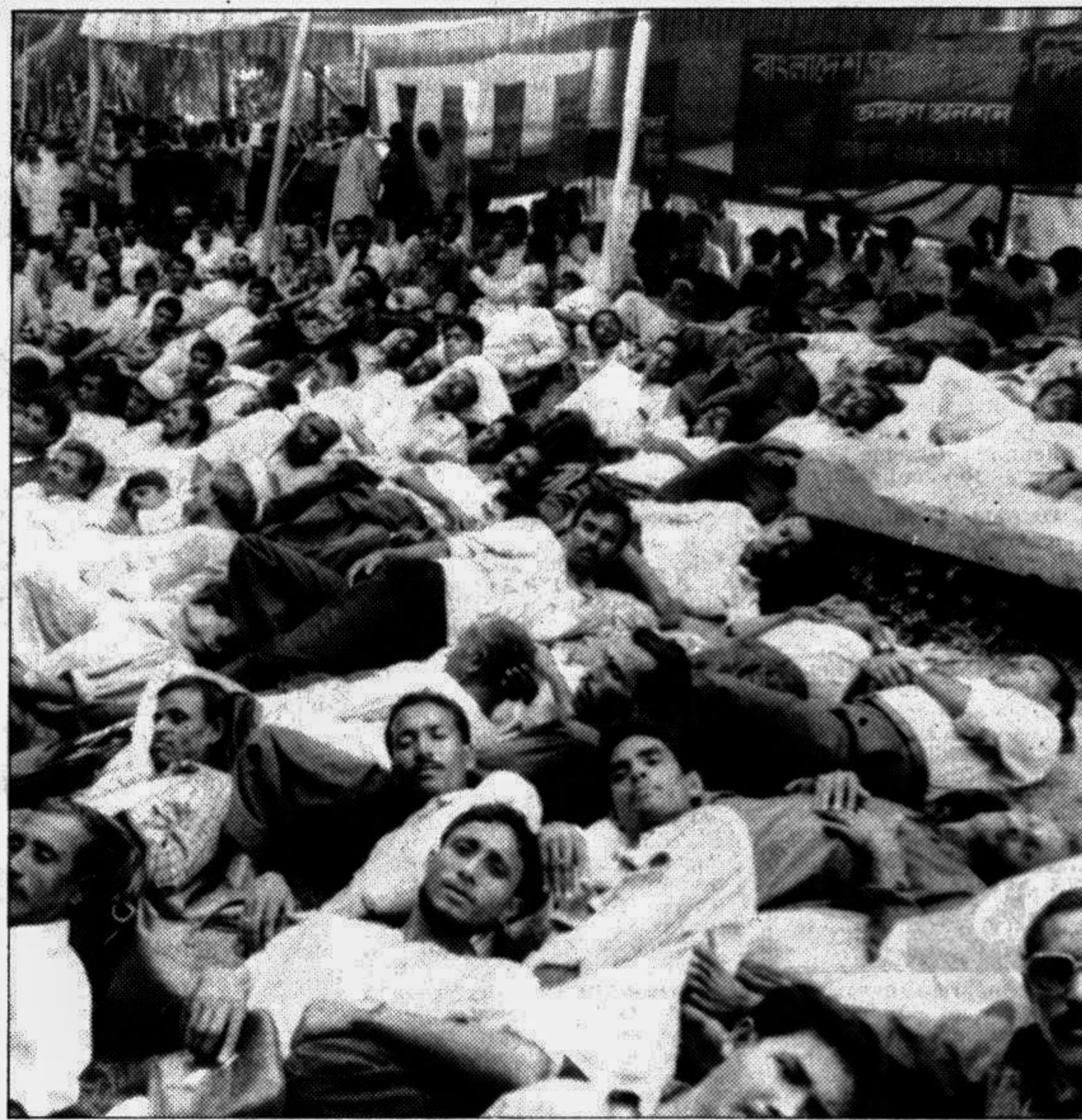
Teachers of non-government primary schools began a fast unto death at Osmany Uddyan in the city yesterday.

This increase became effective from July 1997 and the teachers will get the allowance at increased rate from this month, she added.