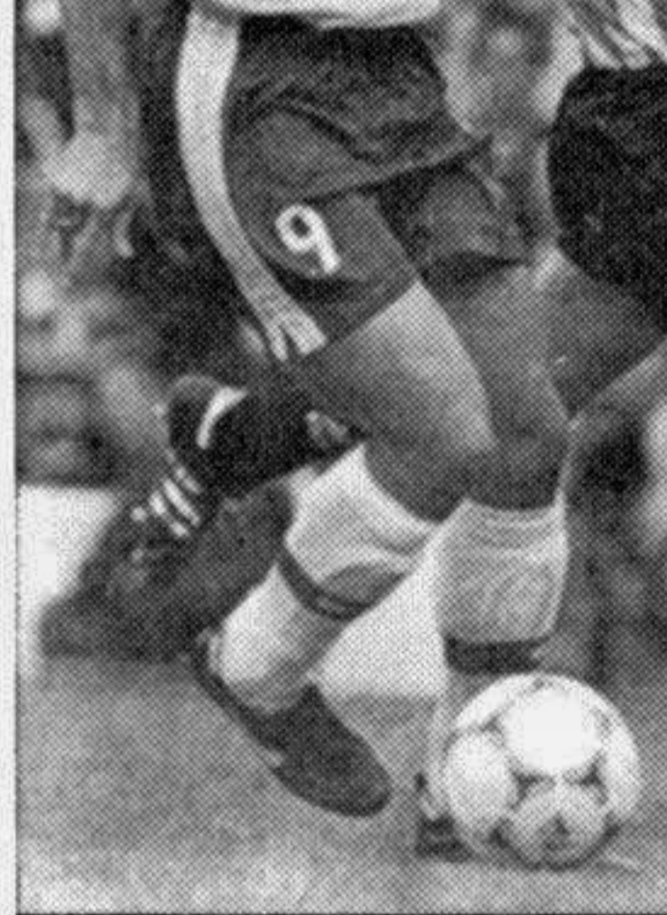
Superstar Ronaldo (L) in action during Brazil's World Cup warm-up match against Athletic Bilbao at Bilbao on May 31. The match ended 1-1.

Brazil showed the same lack of cohesion as they had done in their last full international, a 1-0 home defeat against a vastly superior Argentina last month.