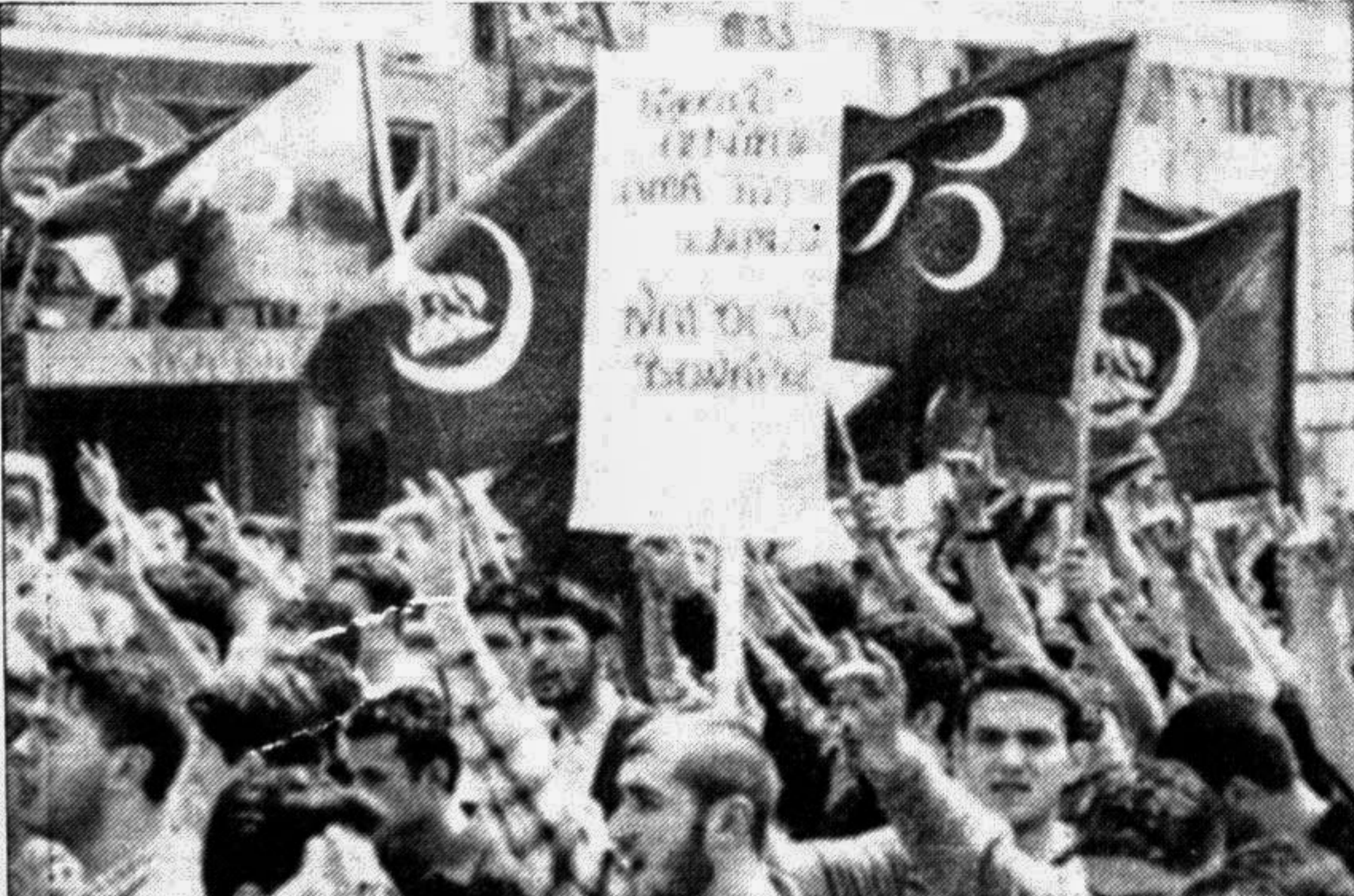
Ultranationalist demonstrators chant anti-French slogans as they hold the flags of the Nationalist Movement Party, at Istanbul's Taksim Square, Sunday. A group of ultranationalist demonstrators gathered before the consulate to protest a French parliamentary motion recognising the Armenian genocide of 1915.