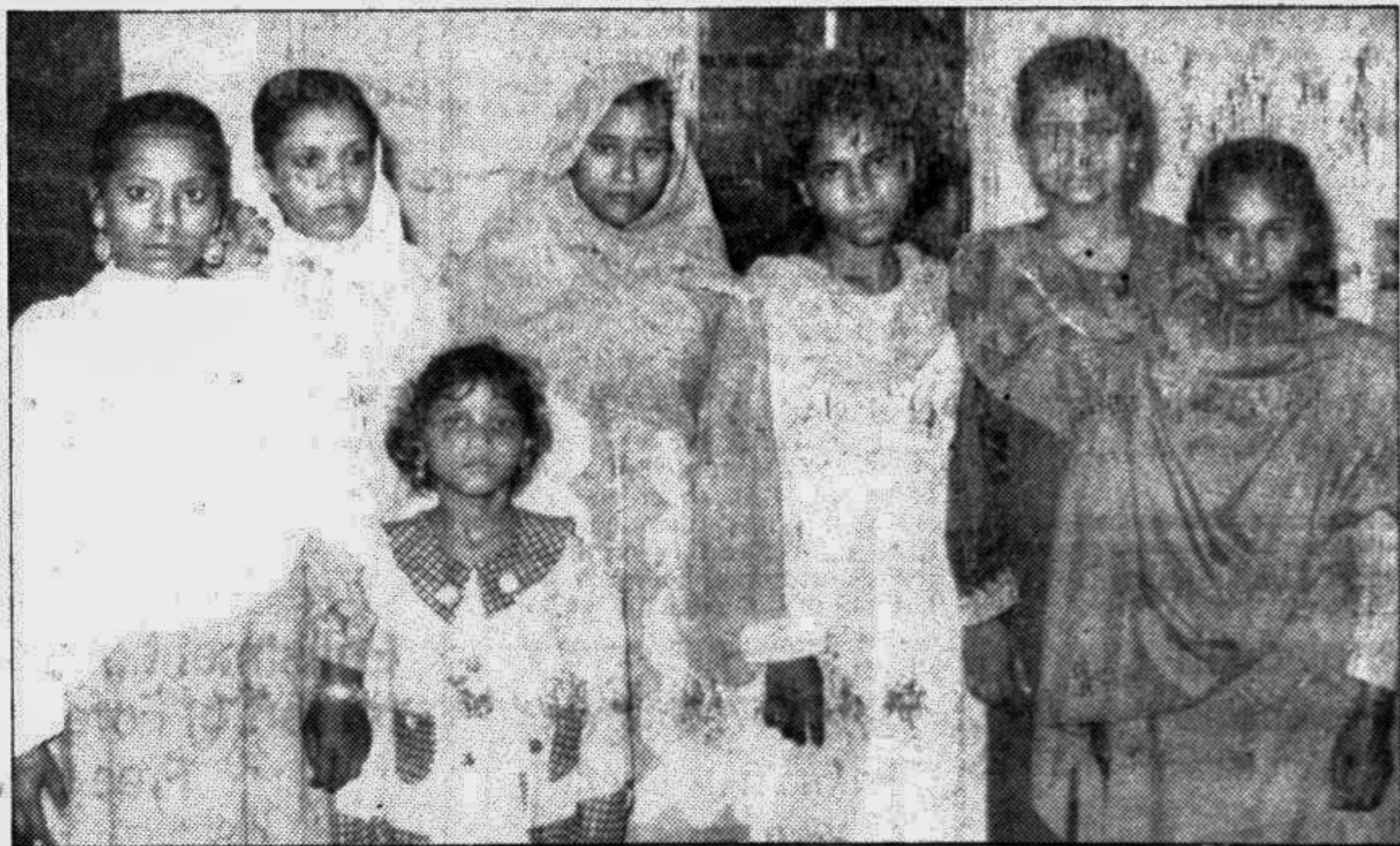
The victims of trafficking who were brought back to Dhaka from Pakistan yesterday.