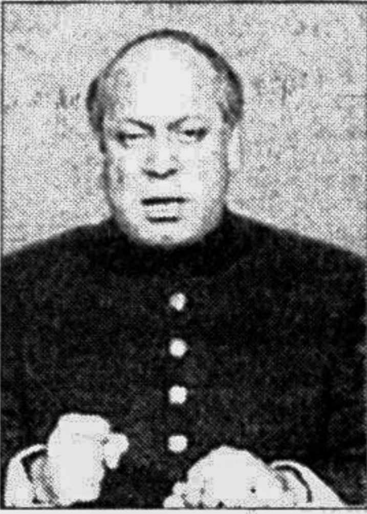
Sharif addressing the nation on TV yesterday.

ISLAMABAD, May 28: Pakistan detonated five nuclear devices today, Prime Minister Nawaz Sharif said in an address to the nation, reports AP. "We have matched India with five tests of our own," he said in his 30-minute speech to the nation. At a news conference afterward, Sharif said there was no release of radioactivity into the atmosphere as a result of the testing. However, he did not offer any information about the type or strength of the devices Pakistan exploded near the border with Iran and Afghanistan. Originally it was believed that only two devices were exploded at a remote test site in the desolate Baluchistan province. Sharif, who said India's recent test of five nuclear devices violently tilted the balance of power in the region, offered to renew talks with India "to address any outstanding issue including the core issue of Jammu and Kashmir." He also offered a non-aggression pact with India over Kashmir. India's nuclear testing combined with the deployment of long-range Prithvi missiles against Pakistan, seriously threatened his country's security, said Sharif. But Pakistan received no offer of assistance or security guarantees from the rest of the world. See Page 12 Col 4