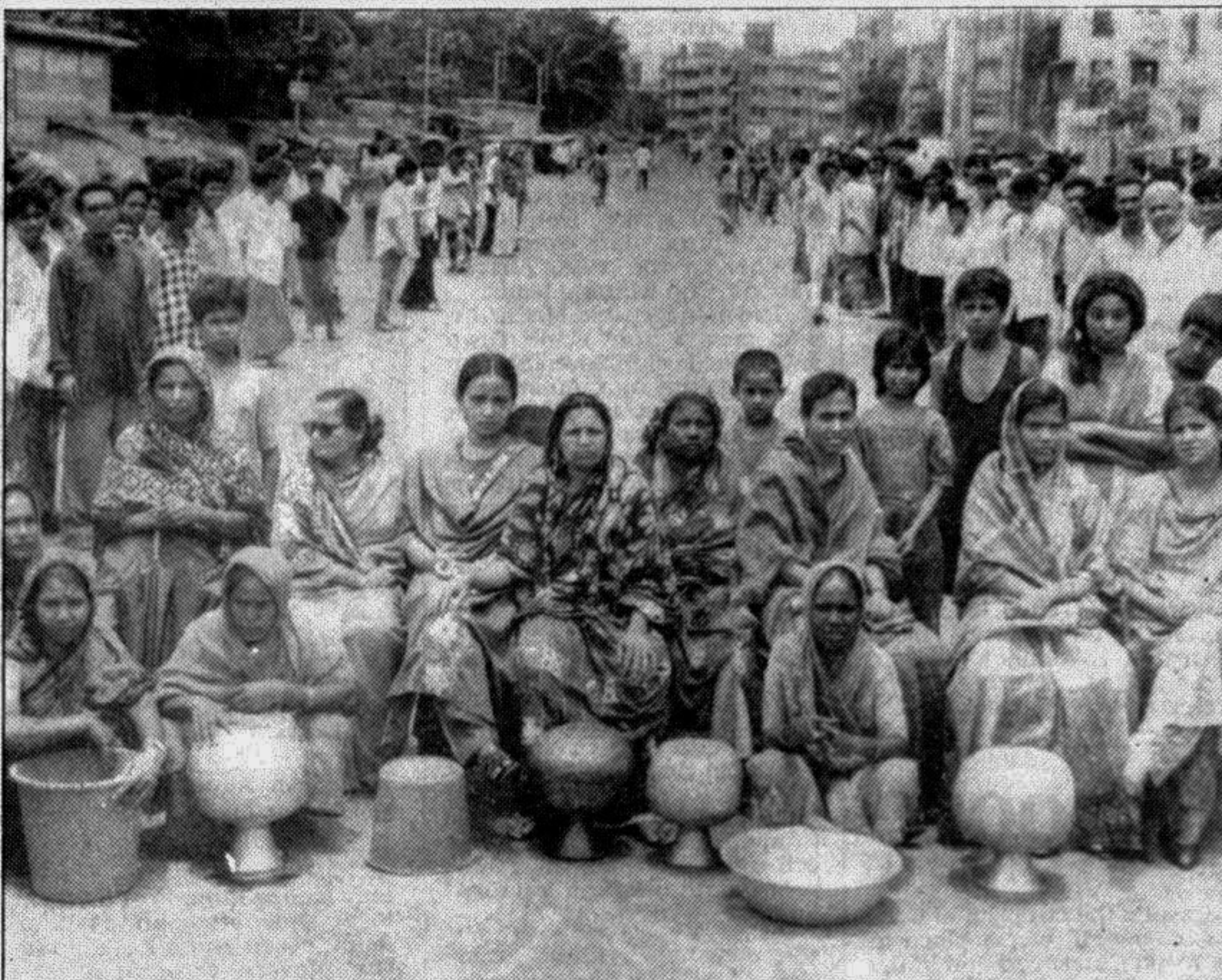
Residents of Sabujbagh area barricaded the Biswa Road near Kamalapur Buddhist temple in the city yesterday demanding water supply.

Meanwhile, the CID is likely to bring eight carpenters working in Rahman's residence to the CID headquarters for questioning in a couple of days.