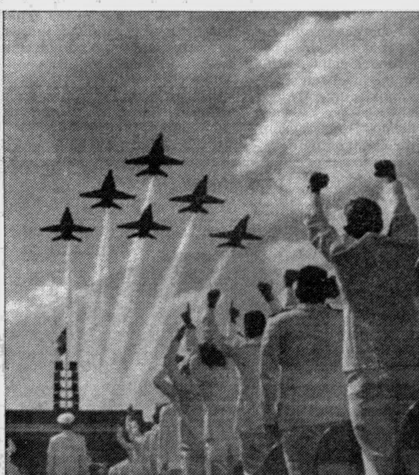
Navy Academy midshipmen cheer as the Blue Angels fly over Navy and Marine Corps Memorial Stadium in Annapolis, USA, Friday at the start of the graduation and commissioning ceremonies.

Kissinger was born into a school teacher's family on May 27, 1923 in this southeastern German city. The Jewish family emigrated to the United States in 1938 to escape Nazi persecution. Kissinger became a US citizen in 1943.