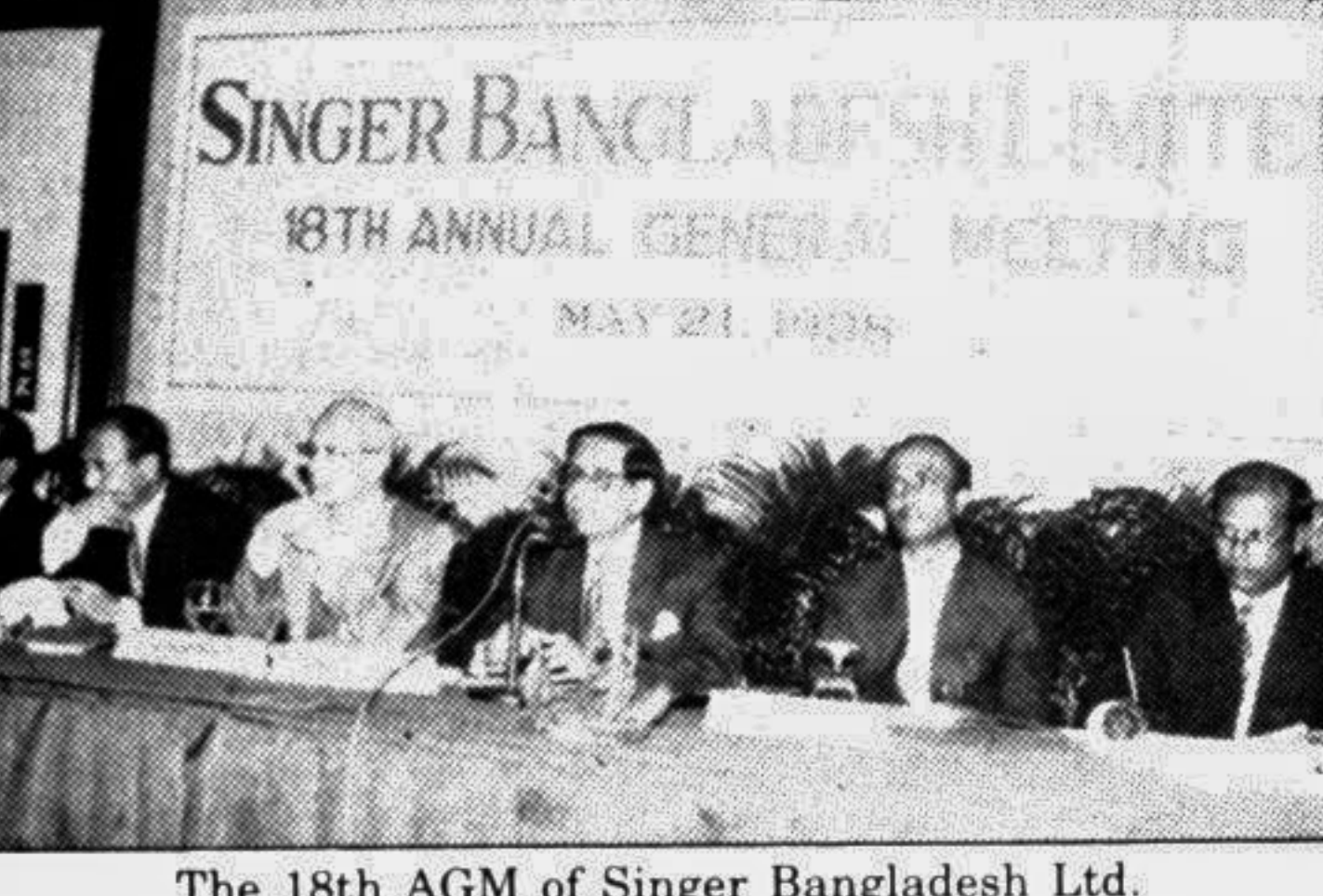
The 18th AGM of Singer Bangladesh Ltd.