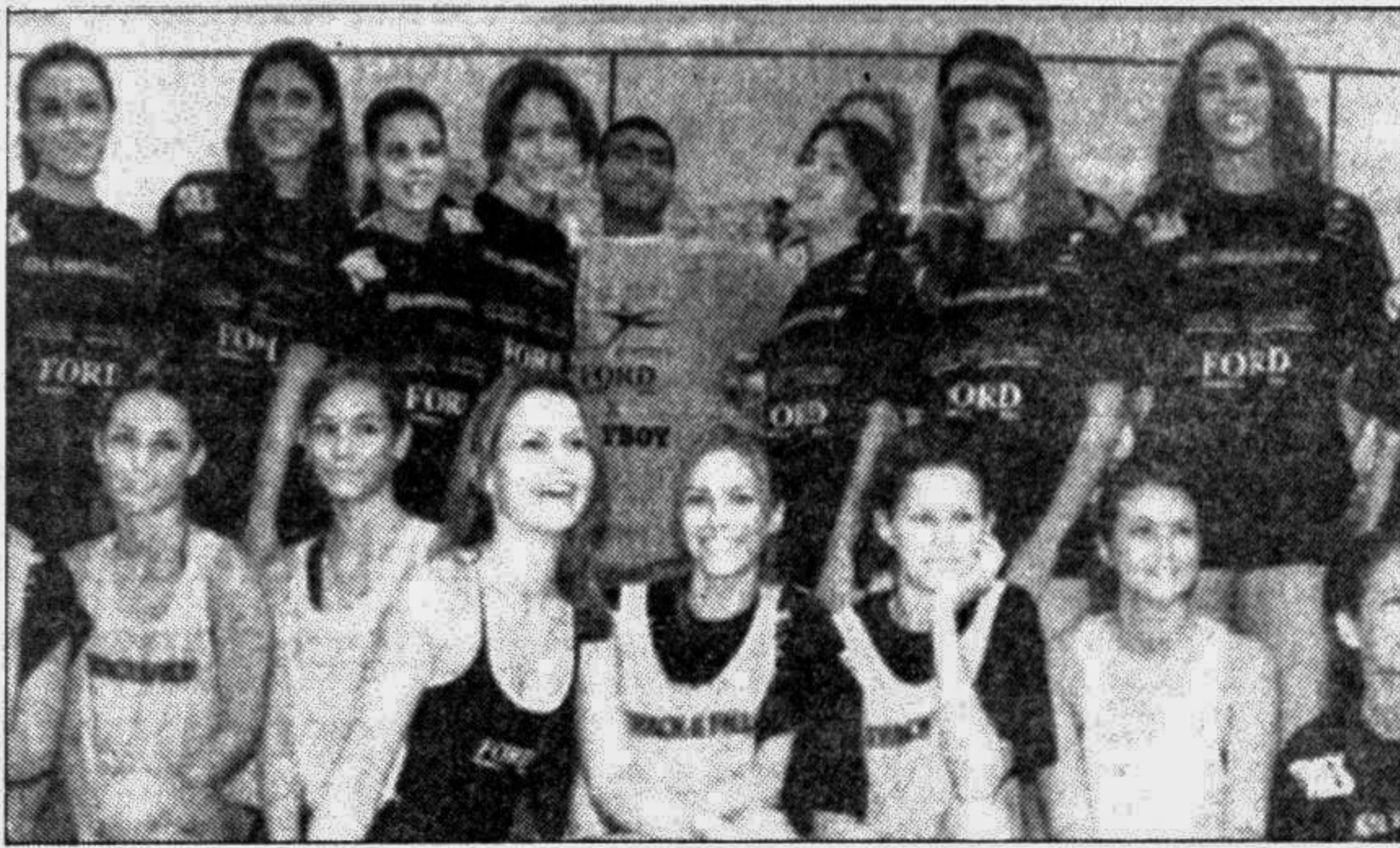
PLAYBOY ROMARIO! Brazil's super-striker Romario (C) is engulfed by models during an exhibition football game at Rio de Janeiro on May 17.