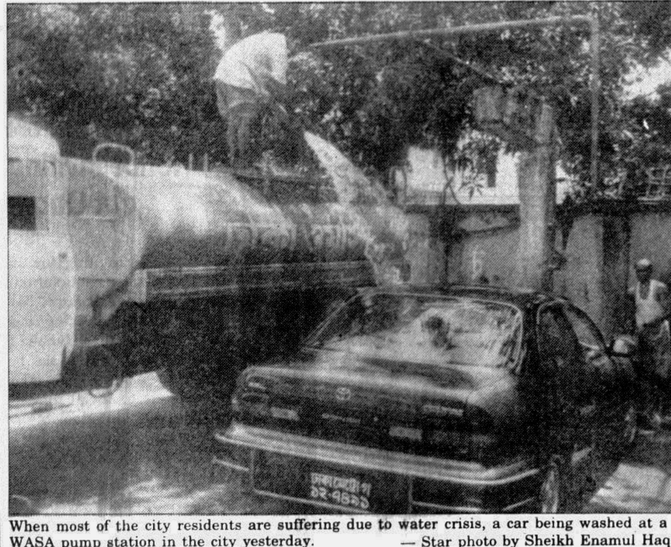
When most of the city residents are suffering due to water crisis, a car being washed at a WASA pump station in the city yesterday.