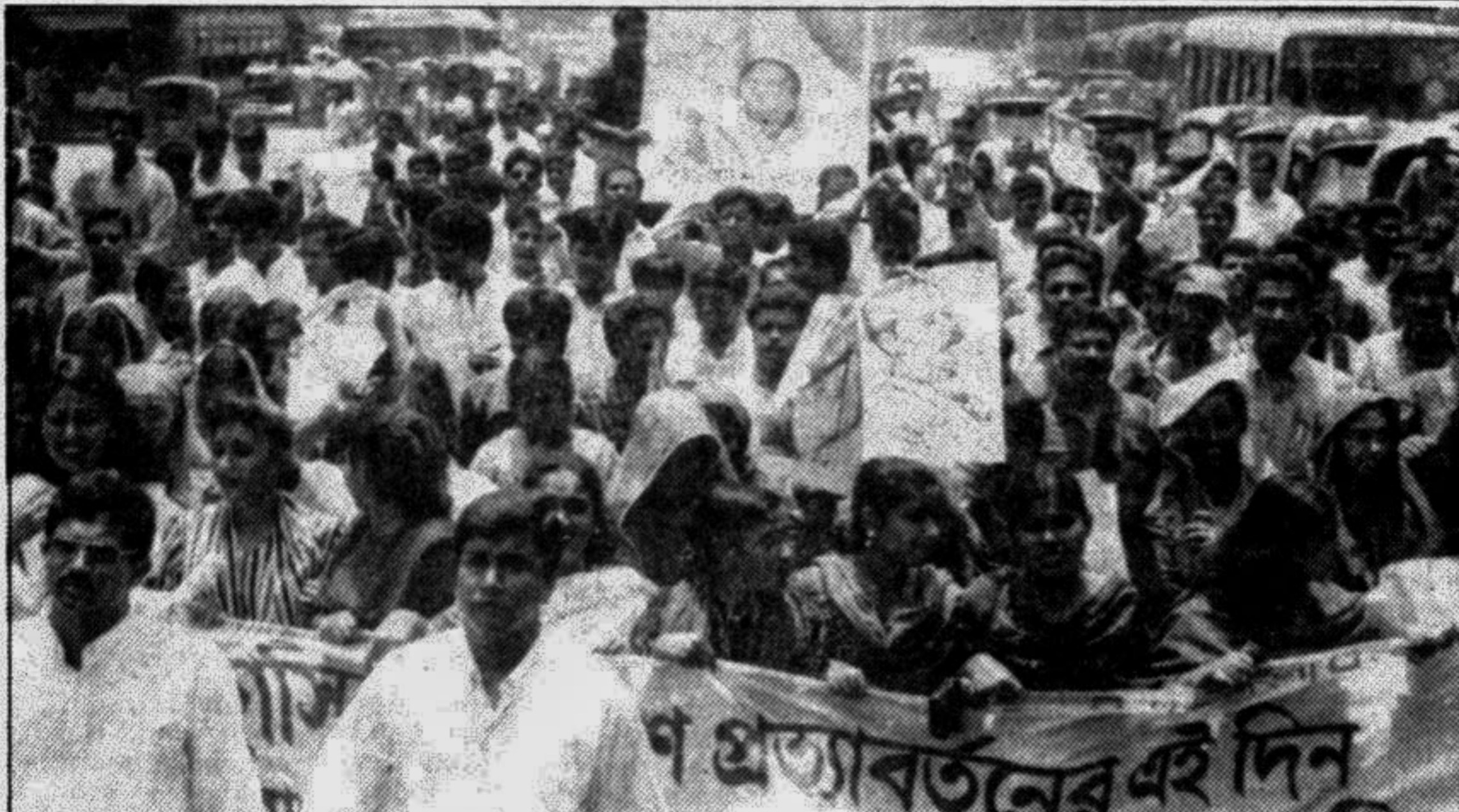
BCL brought out a procession in the city yesterday to mark Prime Minister Sheikh Hasina's Homecoming Day.

By Staff Correspondent Christian Peace Conference Bangladesh (CPCB) will hold a "Shanti O Sampriti Mahasammelon (conference on peace and harmony) in the city on May 30, says a press release. At least fifty thousand Christians from across the country are likely to attend the conference. Representatives from some 4500 churches and NGOs will also attend the conference, the release said. Leaders of Christian community have been contacting with the international Christian community to globally observe a "Shanti-Sampriti Prarthana Dibas" prayer day for peace and harmony on May 31, it added.