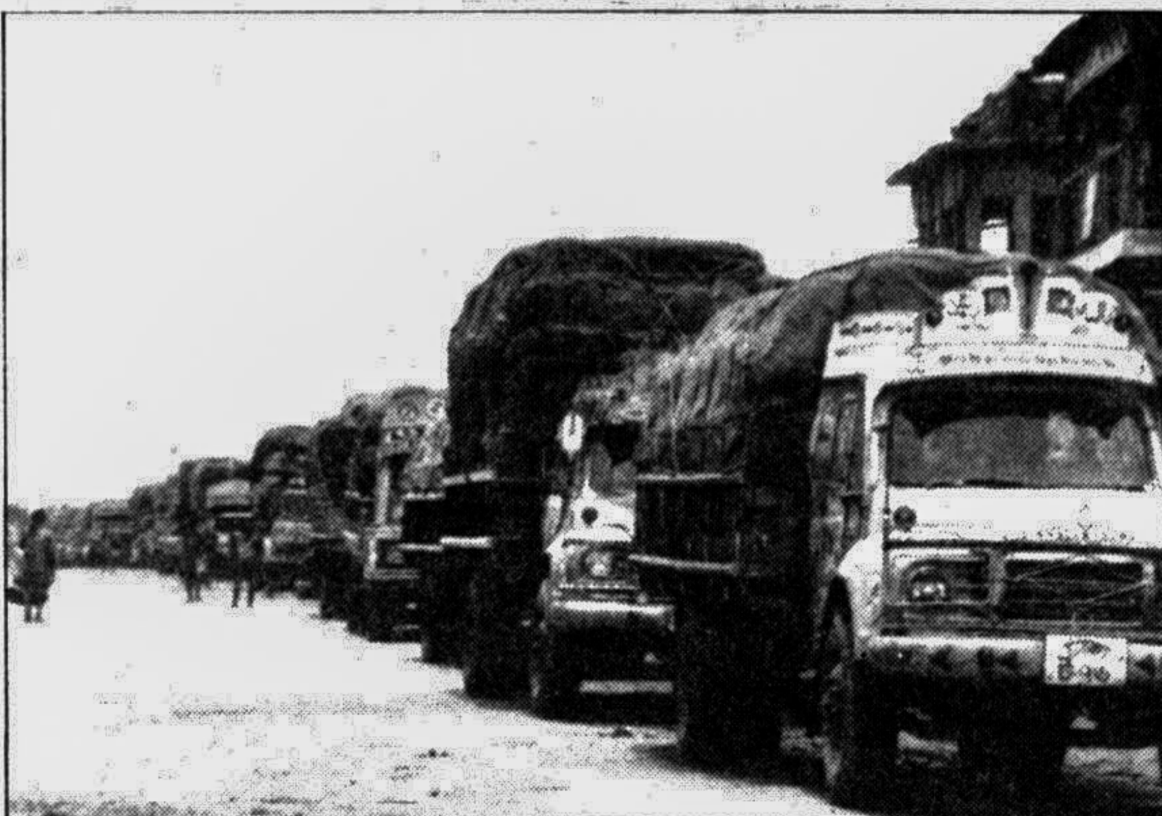
PABNA: Over 500 trucks were stranded at Natakholra ferryghat on May 14. As a result a serious traffic jam was created. A quarrel among drivers of buses, trucks and BIWTA staffers was the reason of such traffic jam.