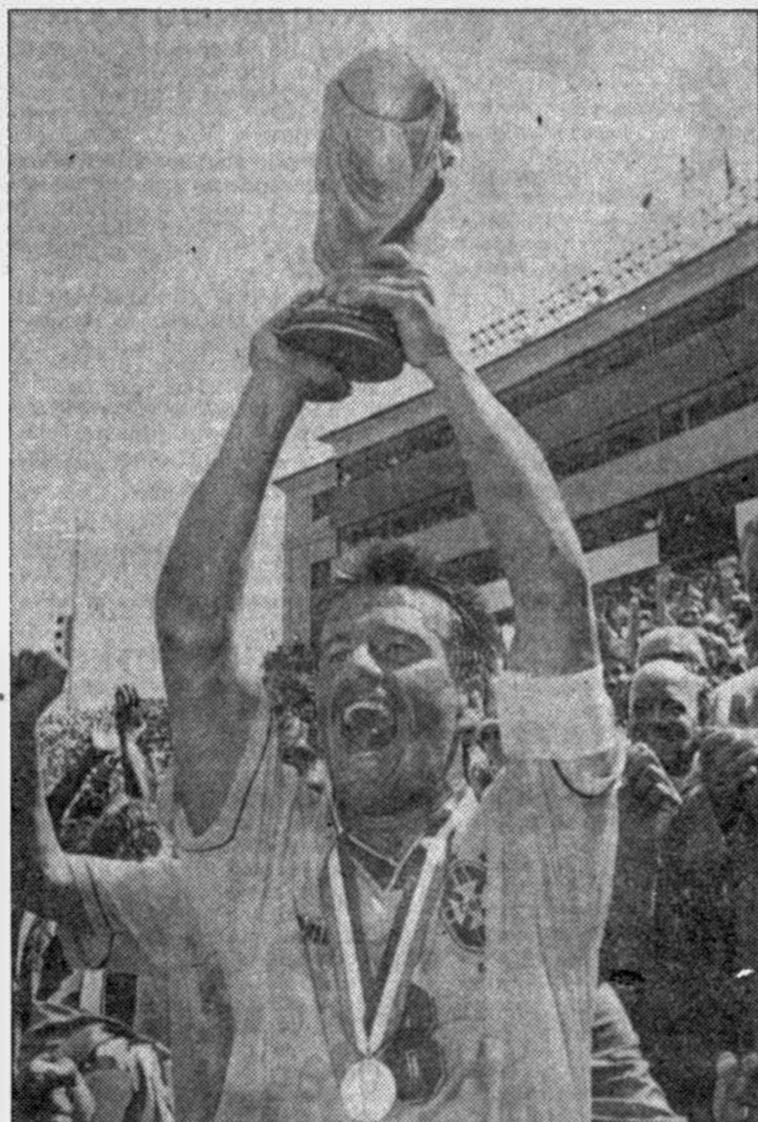
Brazil's captain Dunga celebrates victory in time-honoured fashion.