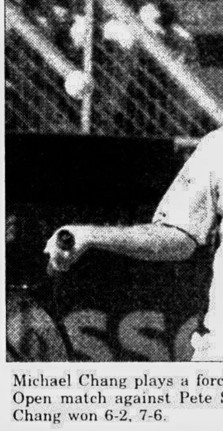
Michael Chang plays a forcing forehand during his Italian Open match against Pete Sampras in Rome on May 14. Chang won 6-2, 7-6.

ROME, May 15 (AP): The refrain is a familiar one for Pete Sampras. Another clay court event, another disappointing performance.