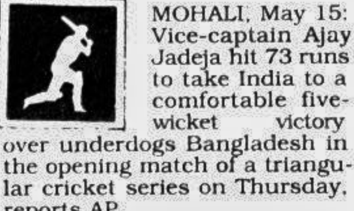
JADEJA... p-o-m Adjusting himself well to a slow wicket with uneven bounce, Jadeja hit eight boundaries and made victory look easy in the end.

Kenya will play Bangladesh on Sunday in the second match at Hyderabad, capital of southern Andhra Pradesh state.