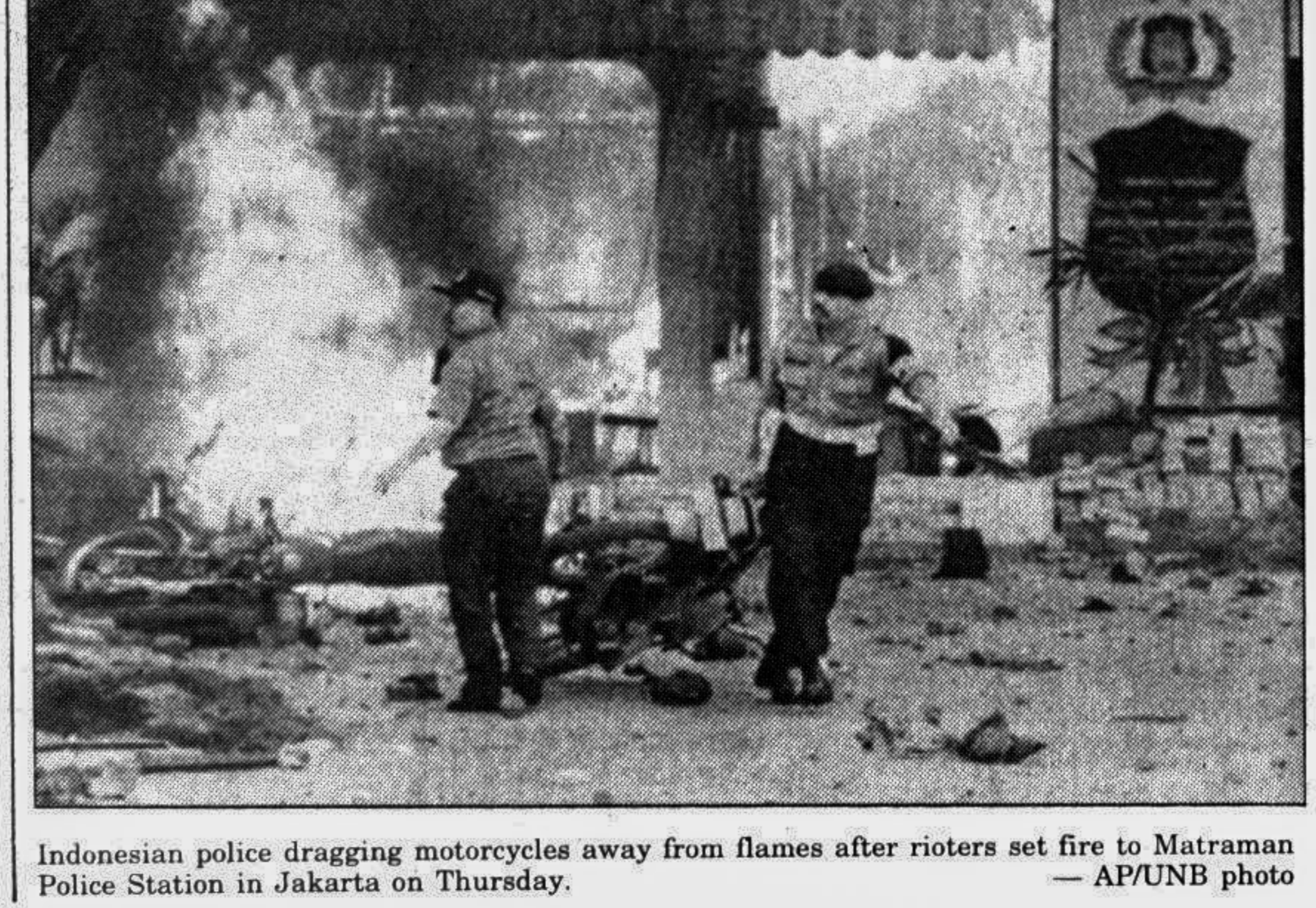
Indonesian police dragging motorcycles away from flames after rioters set fire to Matraman Police Station in Jakarta on Thursday.