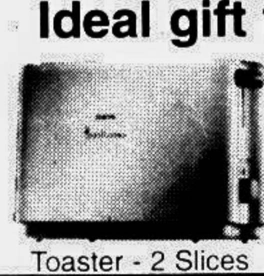
Toaster - 2 Slices