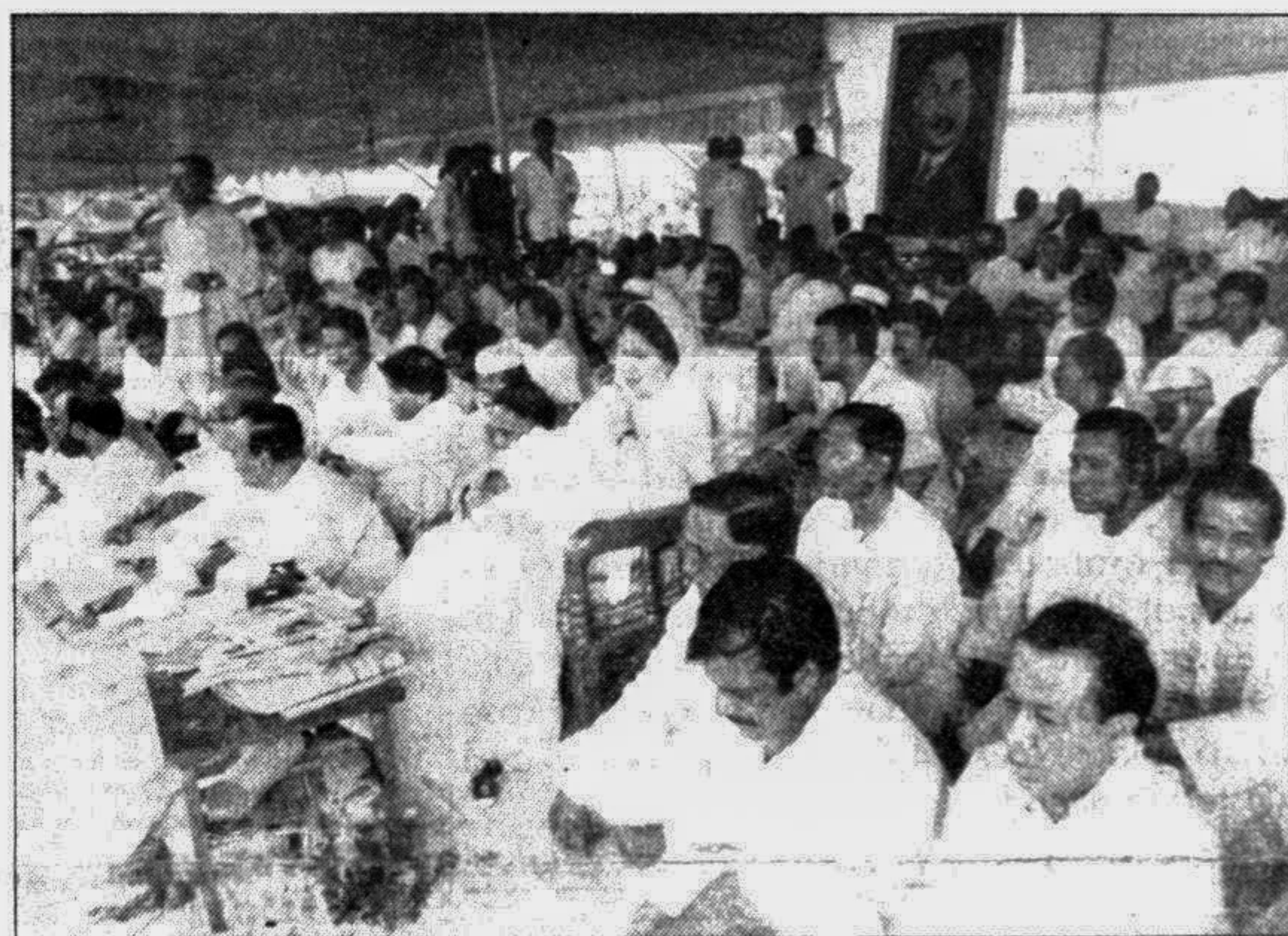
Leader of the Opposition in the Jatiya Sangsad and BNP Chairperson Begum Khaleda Zia and her party MPs observed a day-long hunger strike at Paltan Maidan in the city yesterday.