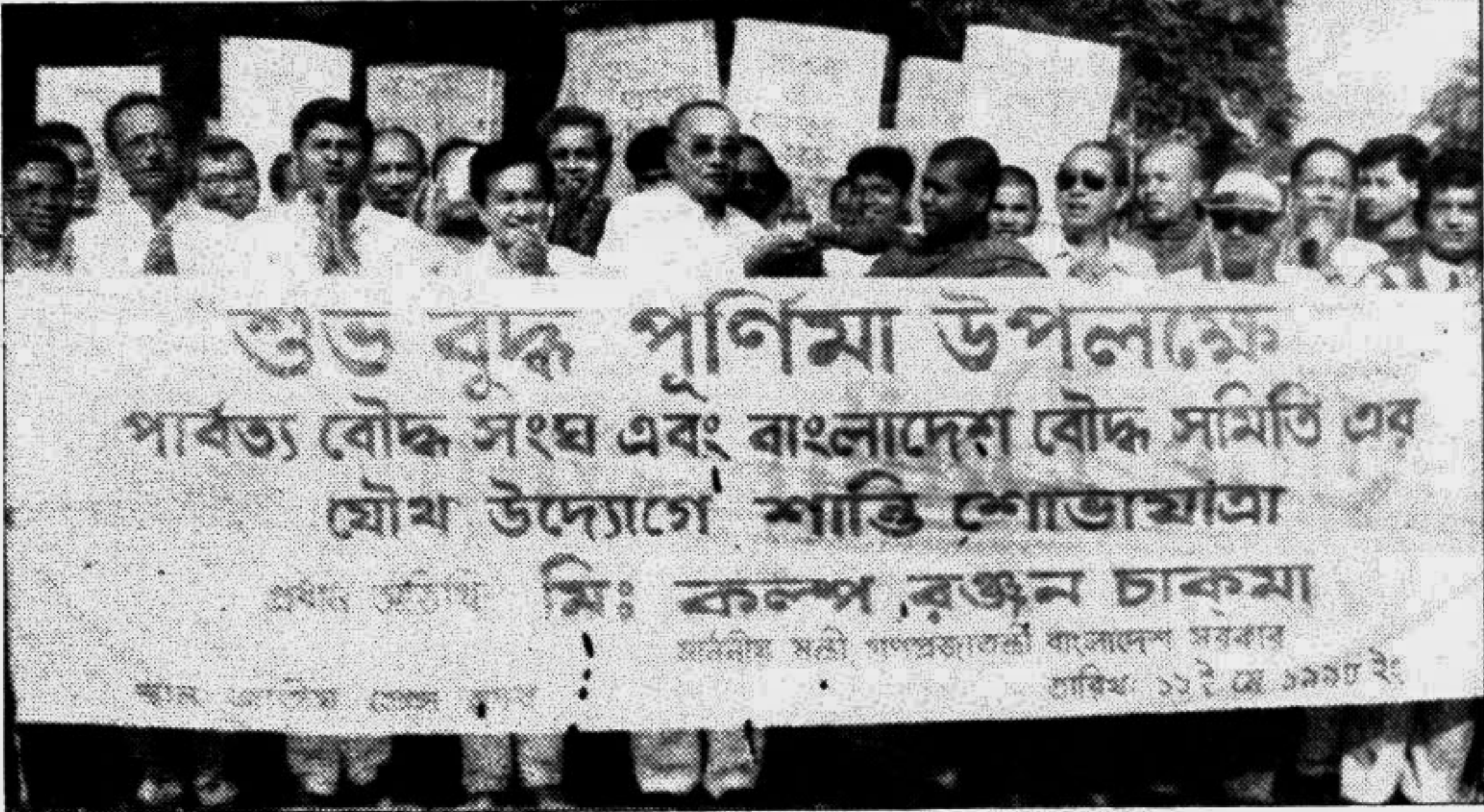
Bangladesh Bouddha Samity and Parbattya Bouddha Sangha brought out a peace procession in the city yesterday on the occasion of Buddha Purnima.