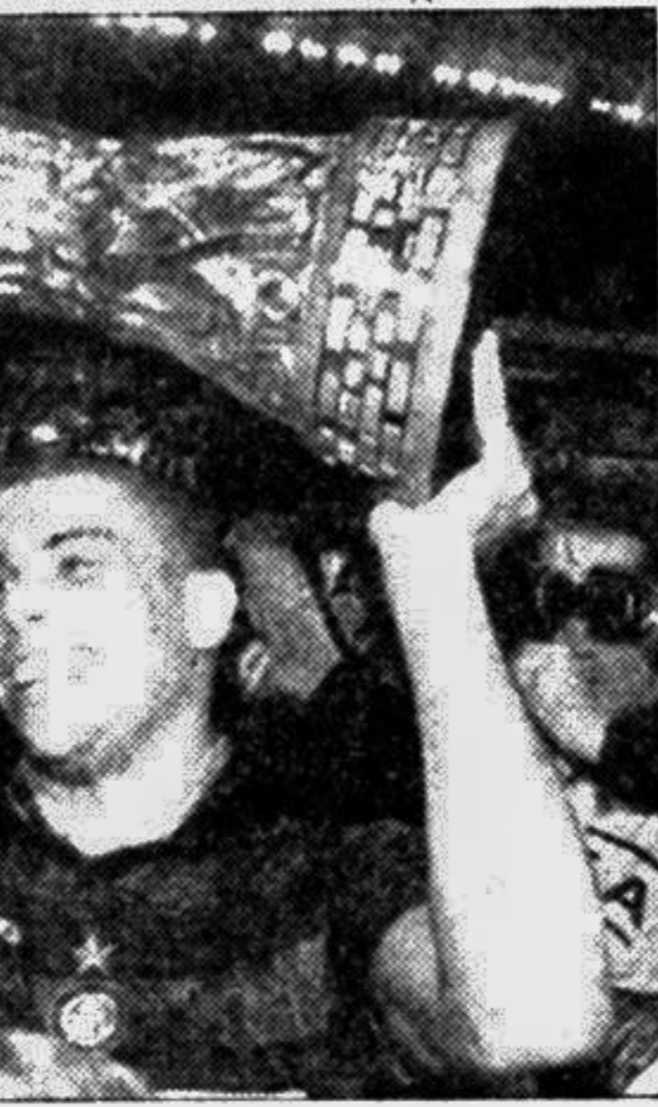
CHAMPION OF THE CHAMPIONS: Inter Milan's brilliant Brazilian Ronaldo lifts the UEFA Cup after their emphatic 3-0 win over Lazio in the final at the Parc des Princes stadium in Paris on May 6. Ronaldo was declared the player-of-the-match.

and shoot across the goal line to safety. Then Nesta earned a yellow card just before Inter added a second in the 60th minute. A cross came over from the right, Zamorano headed the ball back to Zanetti who volleyed with the outside of his right foot into