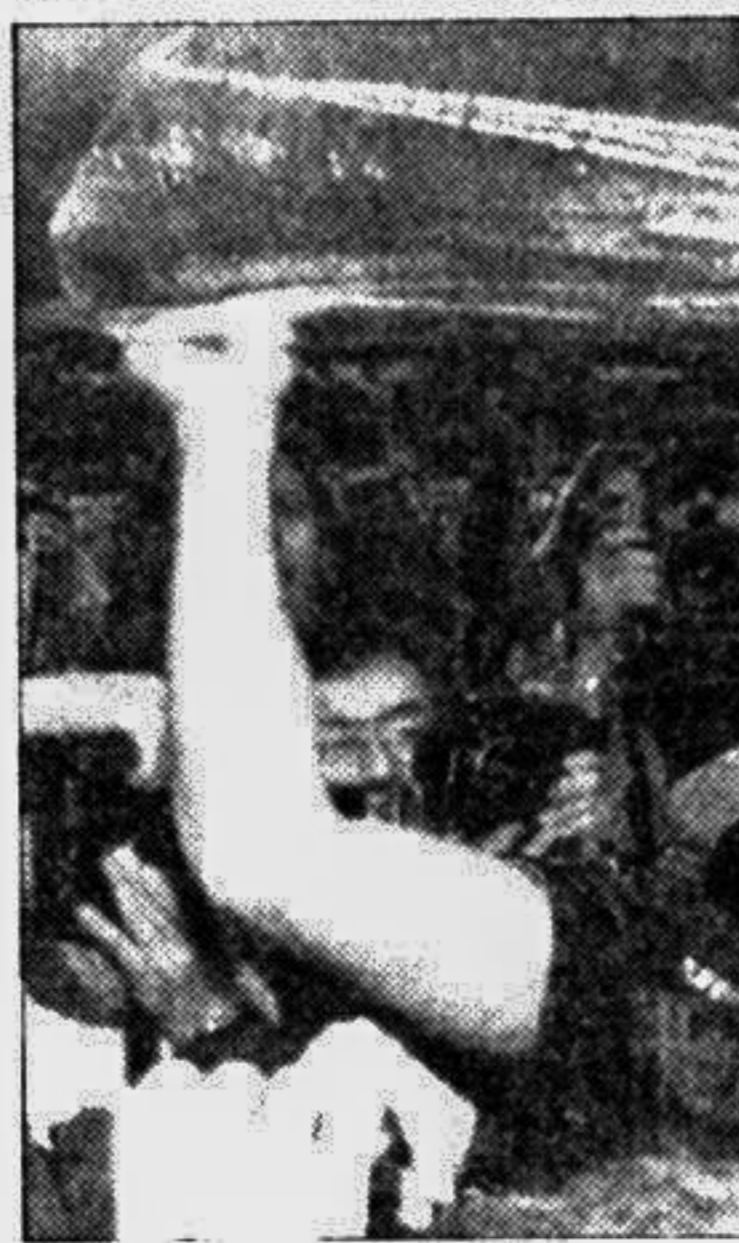
CHAMPION OF THE CHAMPIONS: Inter Milan's brilliant Brazilian Ronaldo lifts the UEFA Cup after their emphatic 3-0 win over Lazio in the final at the Parc des Princes stadium in Paris on May 6. Ronaldo was declared the player-of-the-match.