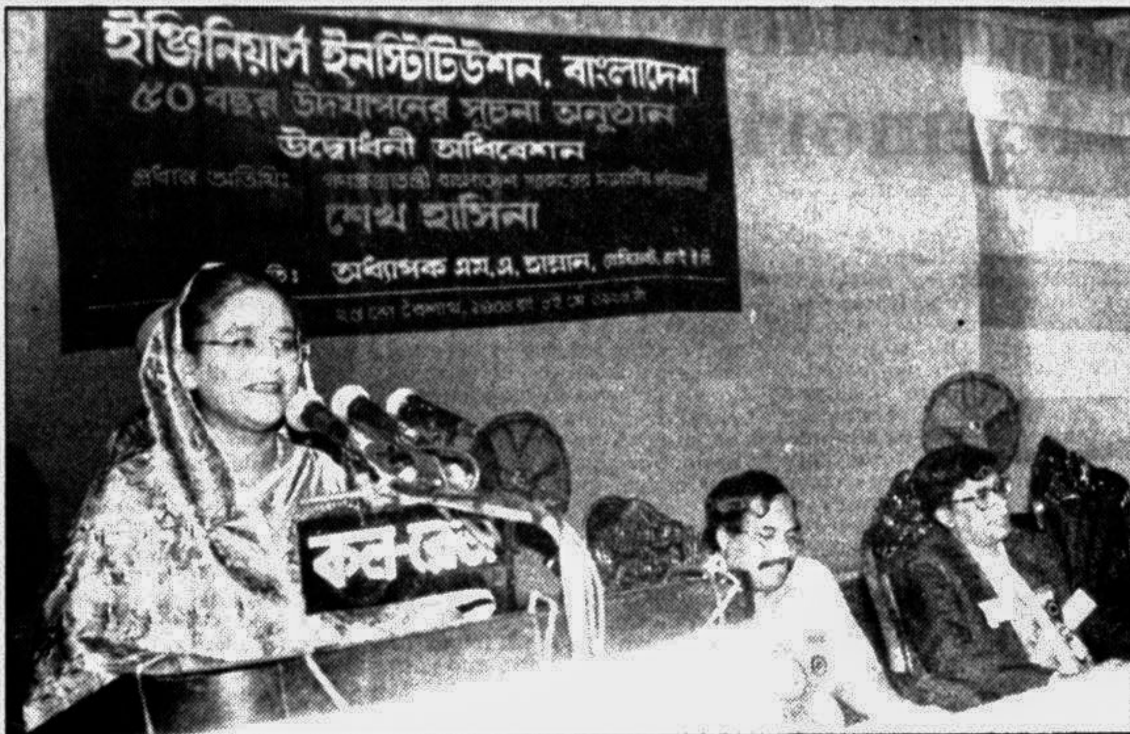
Prime Minister Sheikh Hasina addressing a function marking the 50th founding anniversary of the Engineers Institution, Bangladesh, at the institution premises in the city yesterday.