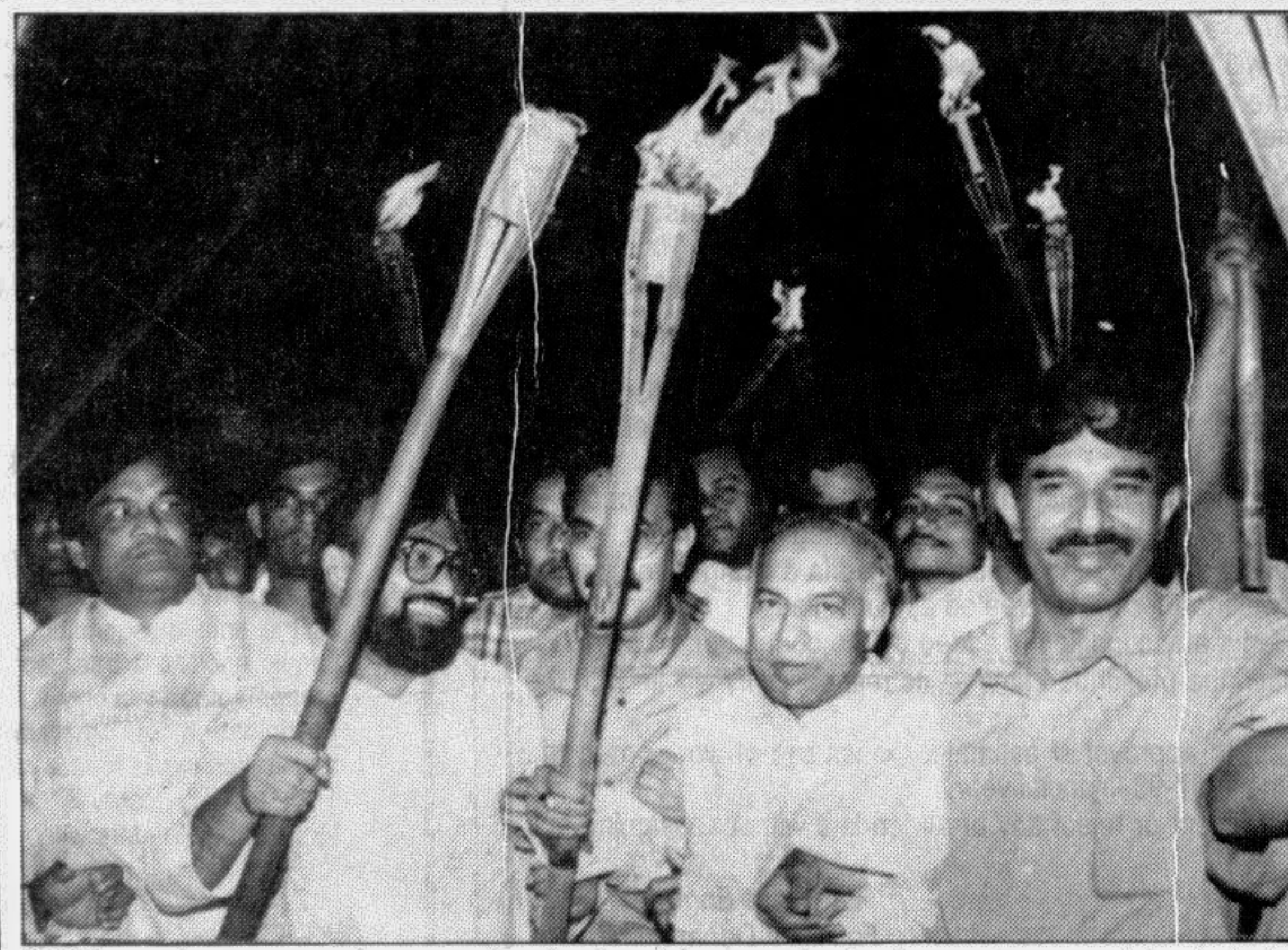
BNP brought out a torch procession in the city yesterday to drum up support for today's half-day hartal.