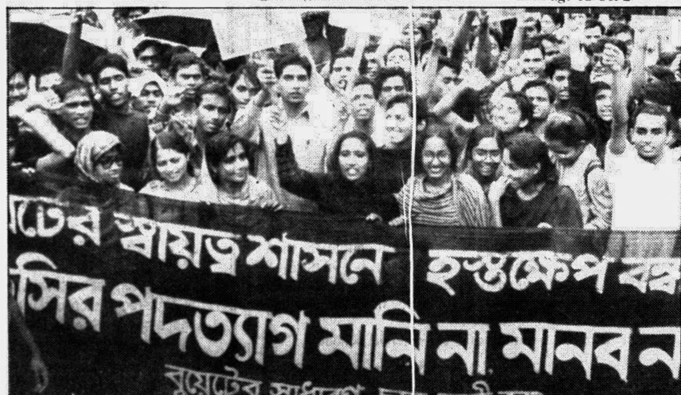
BUET students brought out a procession in the city yesterday protesting government intervention in BUET affairs.