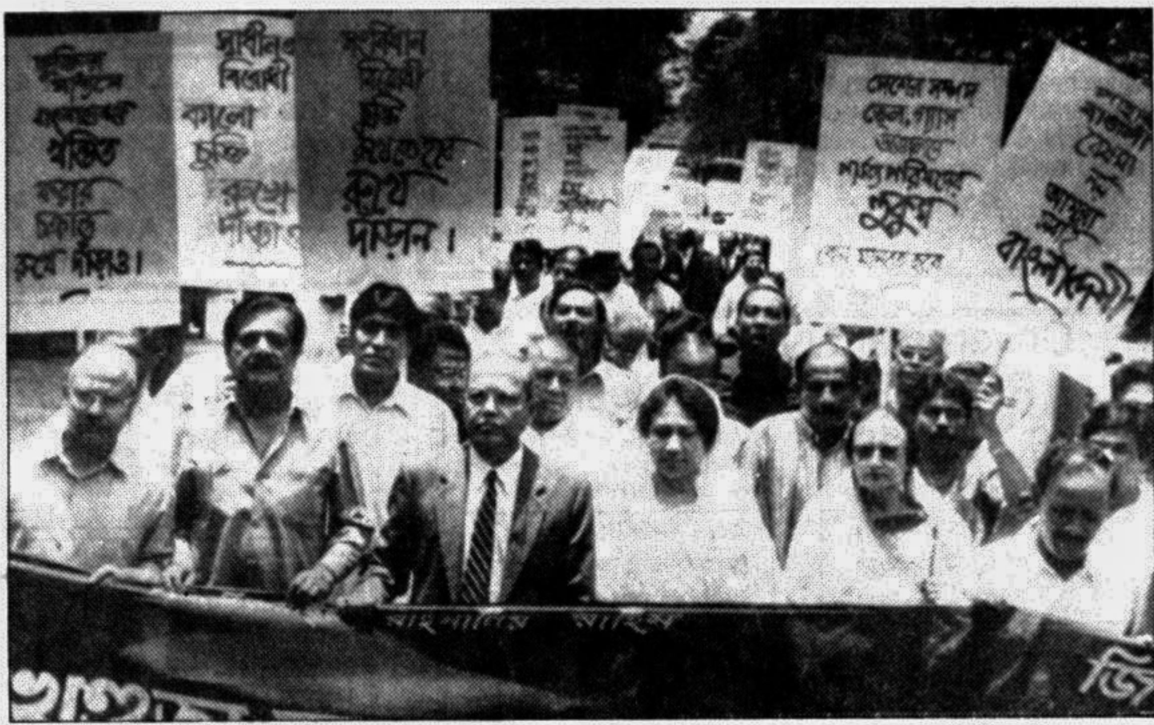
BNP Chairperson and Leader of the Opposition in the Jatiya Sangsad Begum Khaleda Zia leading a procession of her party MPs to the Bangabhaban yesterday.