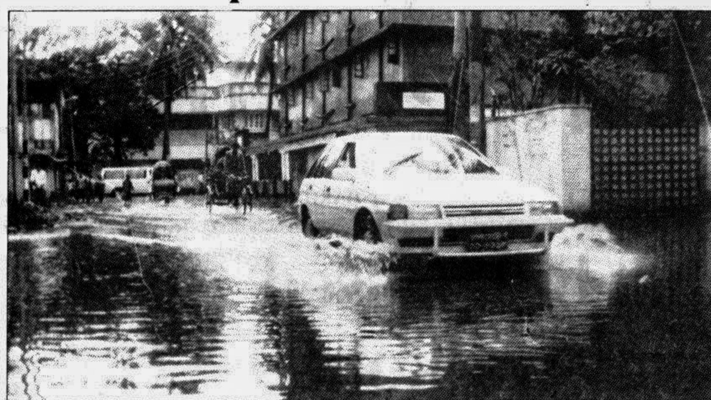
Many city areas were water-logged following a heavy downpour yesterday afternoon. This picture was taken at Segun Bagicha.

Bangladesh Road Transport Authority (BRTA) has taken necessary measures in this regard. Main tax of vehicles can also be paid without fine during the period, said an official handout yesterday.