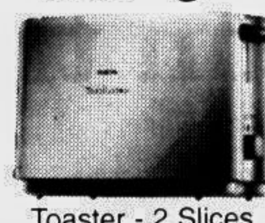
Toaster - 2 Slices