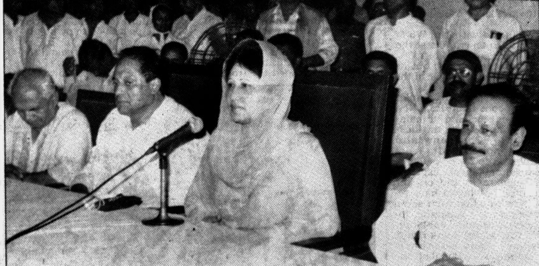
BNP chief Begum Khaleda Zia addressing a May Day rally of Jatiyatabadi Sramik Dal at the Institution of Engineers in the city on Friday.