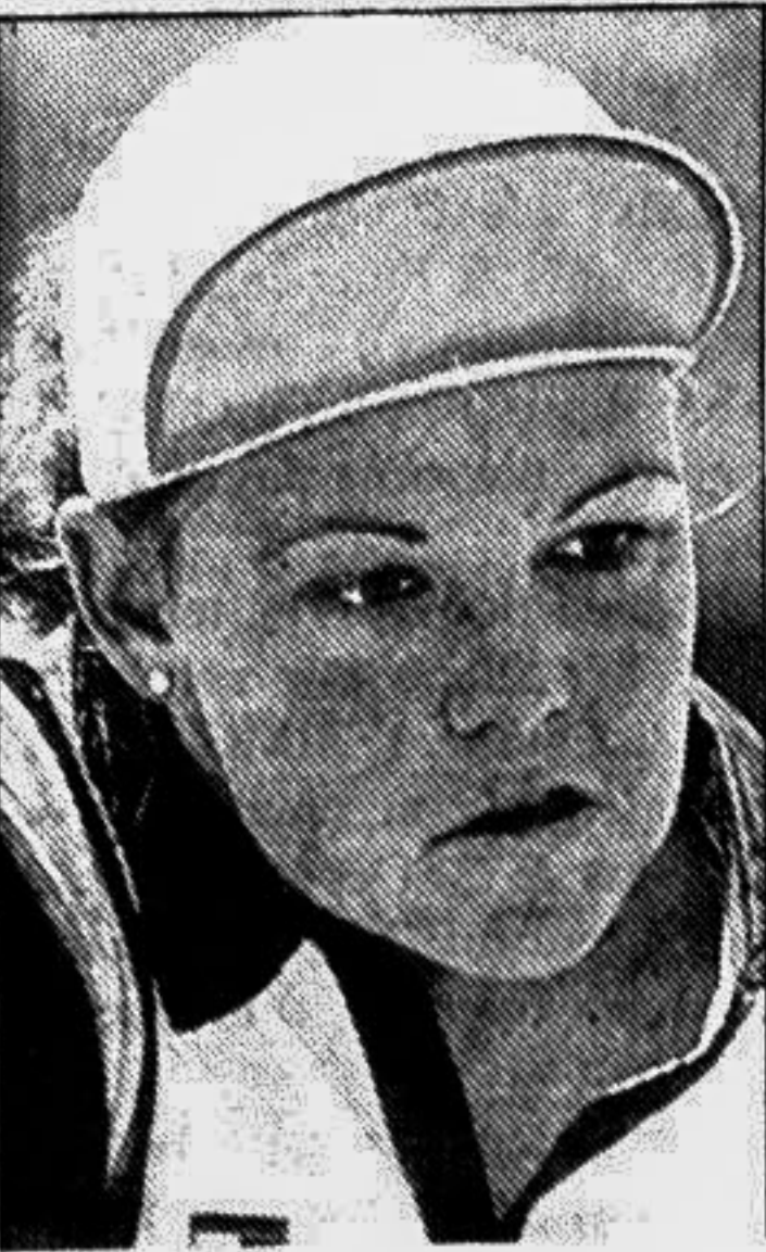
Lindsay Davenport (American tennis player) "I don't think any player on Tour wants to lose to Anna Kournikova ever."