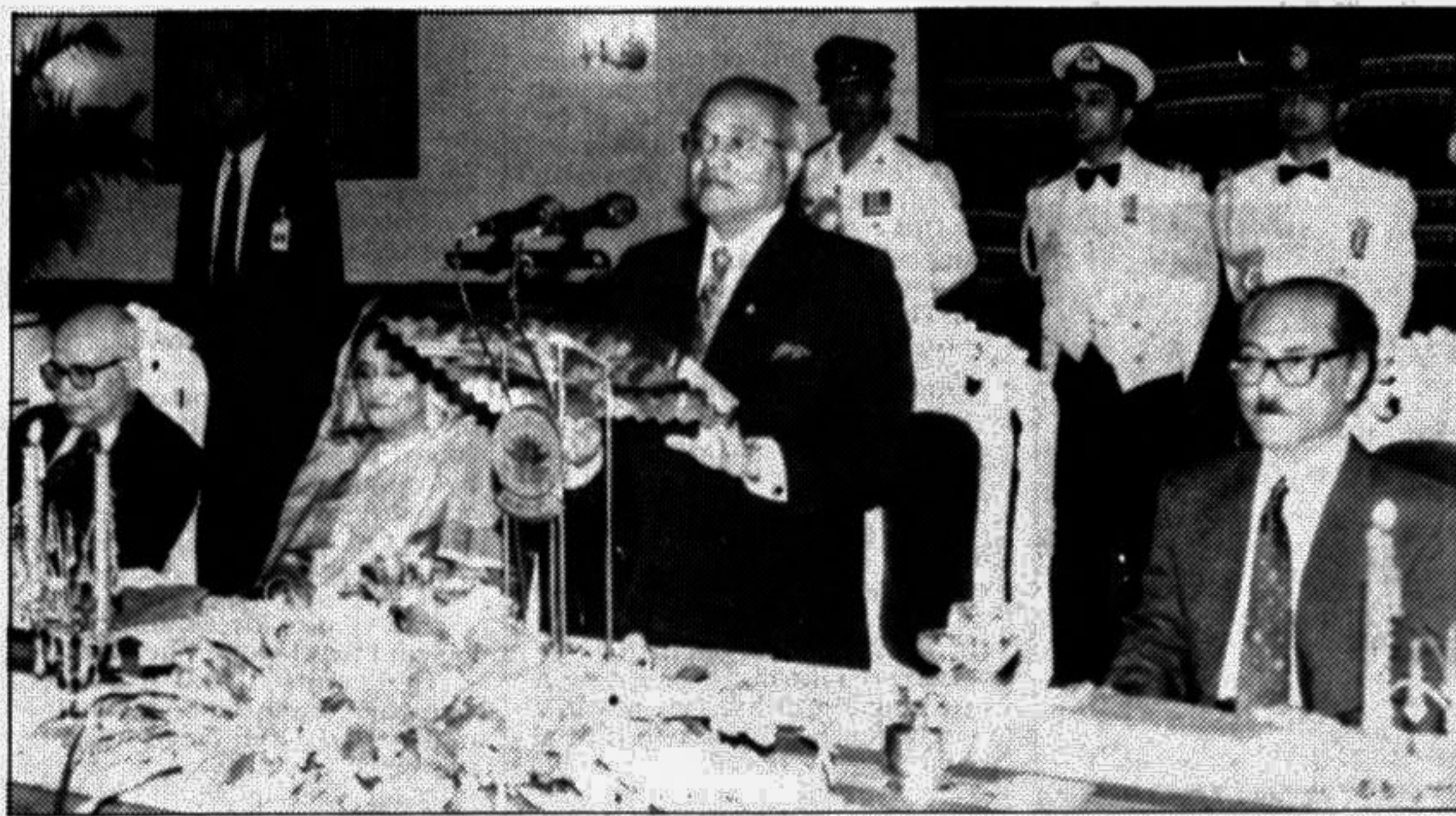
Maldives President Maumoon Abdul Gayoom speaking at a banquet hosted by President Shahabuddin Ahmed at the Bangabhaban yesterday. Prime Minister Sheikh Hasina is also seen.