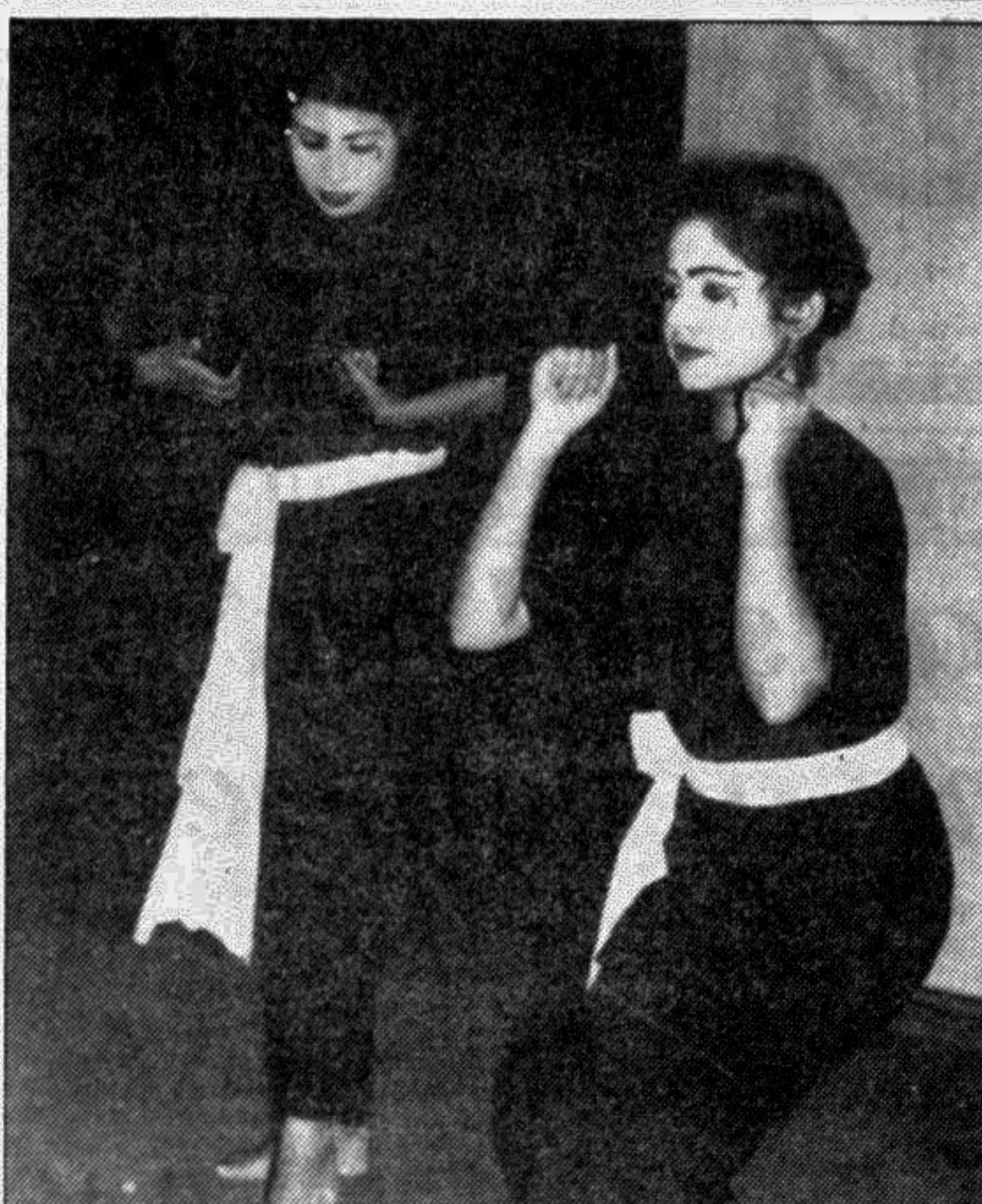
A scene from 'Khandachitra' — a play based on mime by Dhaka Badhir Sangha staged yesterday at its auditorium in the city.

The World Bank Bangladesh Dhaka Office 3A, Paribagh, GPO Box 97, Dhaka-1000 Telephone: 861056.