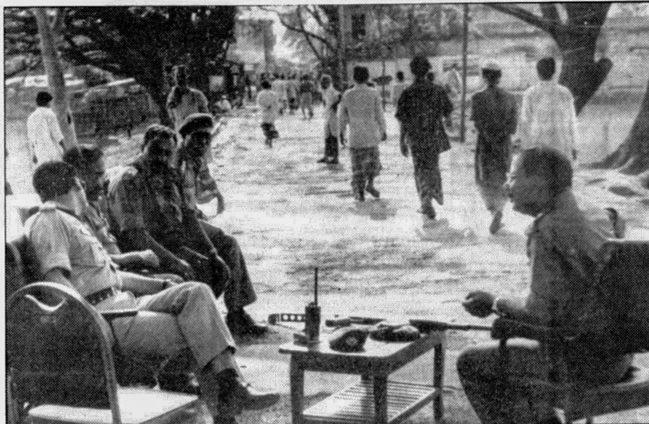
Police officials on duty in the Adamjee Jute Mills area where armed clashes between two groups of workers left two persons dead yesterday.