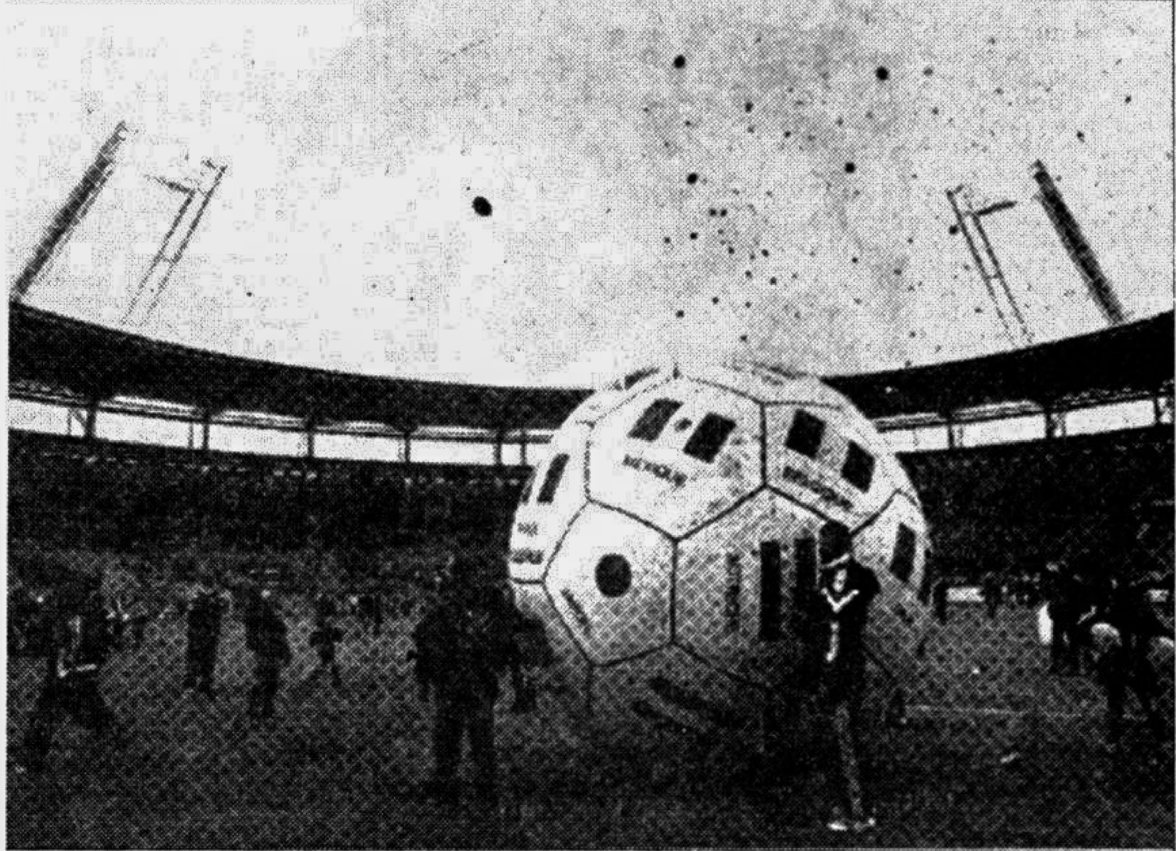
Scene from the inauguration ceremony of Toulouse Stadium as a World Cup venue in the southwestern French city on April 26.

His previous African experience at the World Cup was a painful one. Cameroon crashed in the opening round at USA '94, though a lack of pre-tournament preparation time was probably the most significant reasons for that.